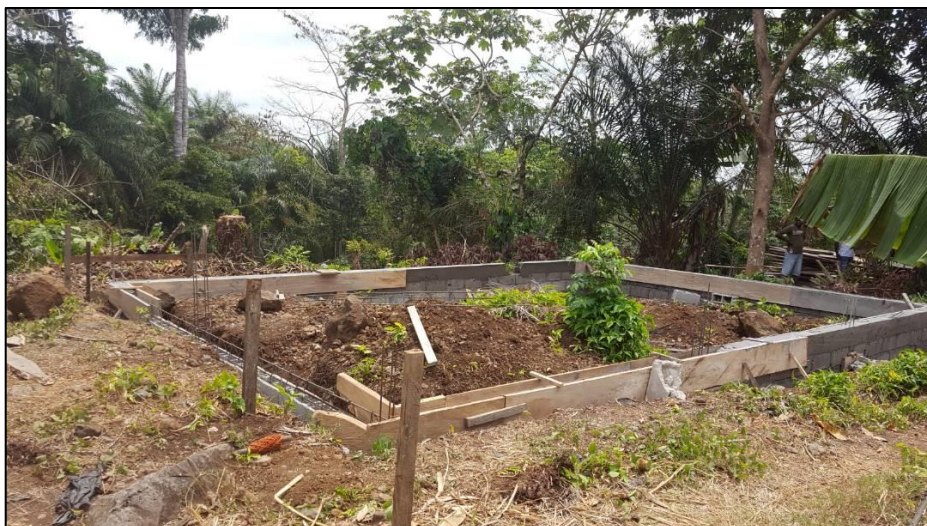
Foundations being laid for the quail farm

As a result, she writes “plans are now in place to have the supervision of a veterinarian and a feed producer to make sure we have quality and quantity... Above all, the oil company that tormented us with hopes has finally granted the