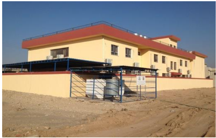
Before and after: the school at Qaraqosh

Islamic State surged into the Plain of Nineveh in the summer of 2014, and the Christian population of 120,000 fled overnight. “The Iraqi authorities told our superiors they would protect us from IS. Right until the last moment, they told us there was nothing to worry about, stay where you are. Then, suddenly, our bishop advised us to collect just what we could carry, and to get out. We had half an hour.”