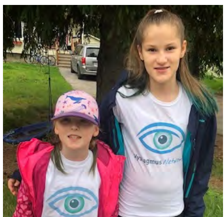
Nystagmus Awareness Day