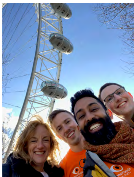
Eye to Eye