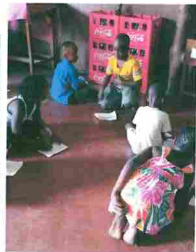
VBSCVC Mombasa Kenya