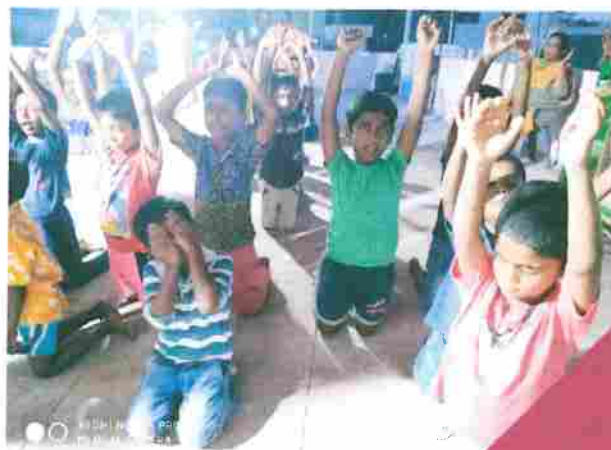
Mangangu, Chennai, India