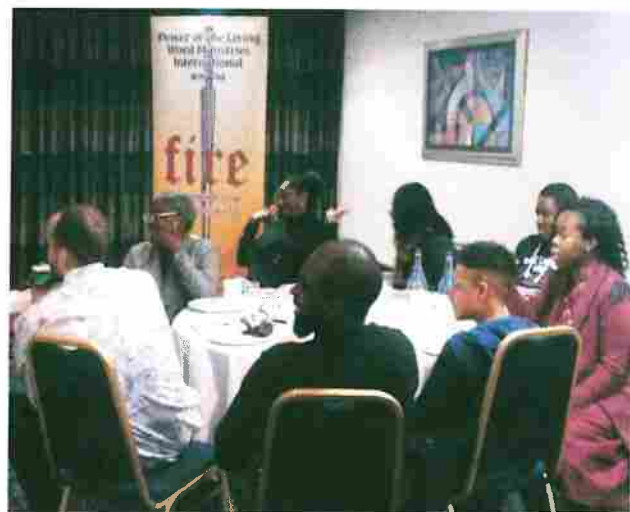
All age participation