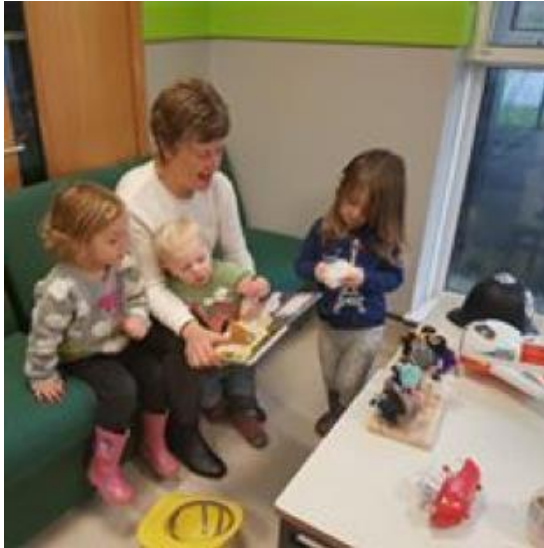
Story time at Chill & Chat