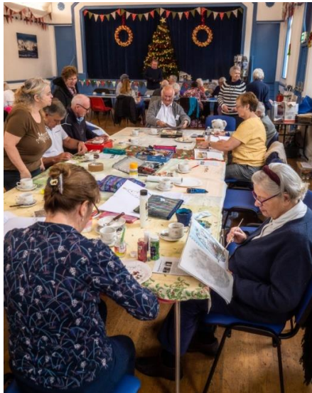
Another pre-Christmas photo from the Wellbeing Café.