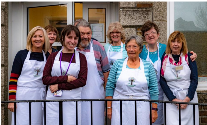
Oasis Café Volunteers