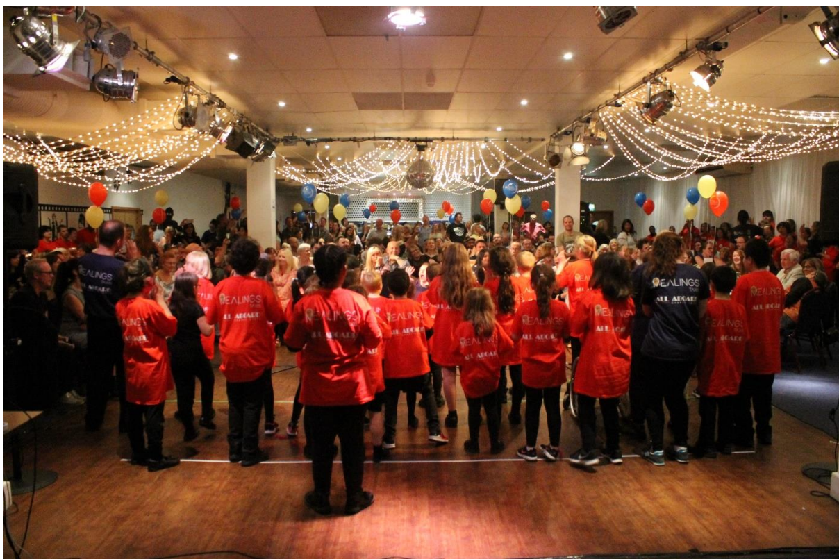
The Greatest Showcase – May 2019