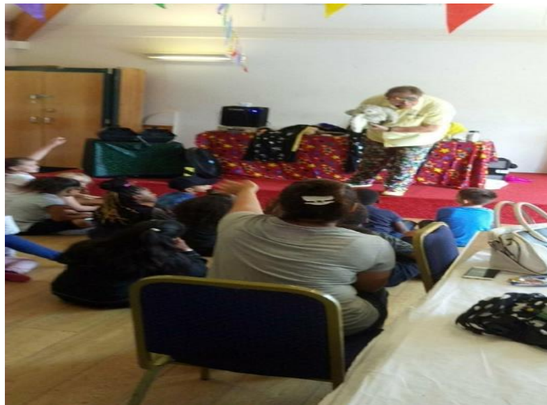
A magician entertaining the children

Hexham Community Association organized a fun day event for the residents on the 11 August 2018