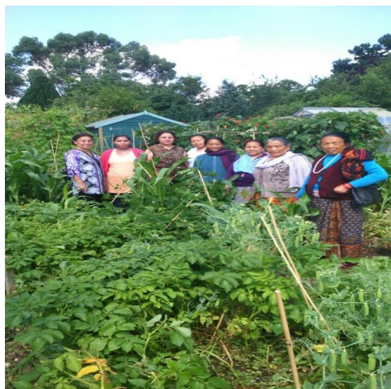
Gardeners in the garden

Gardening: This is done at the Newcastle Road Allotments from 11am to 1pm