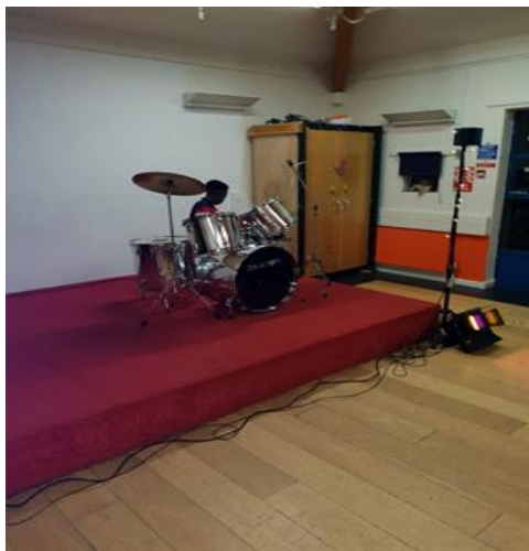
A young talent on drums.