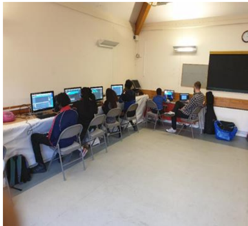
Advanced music session