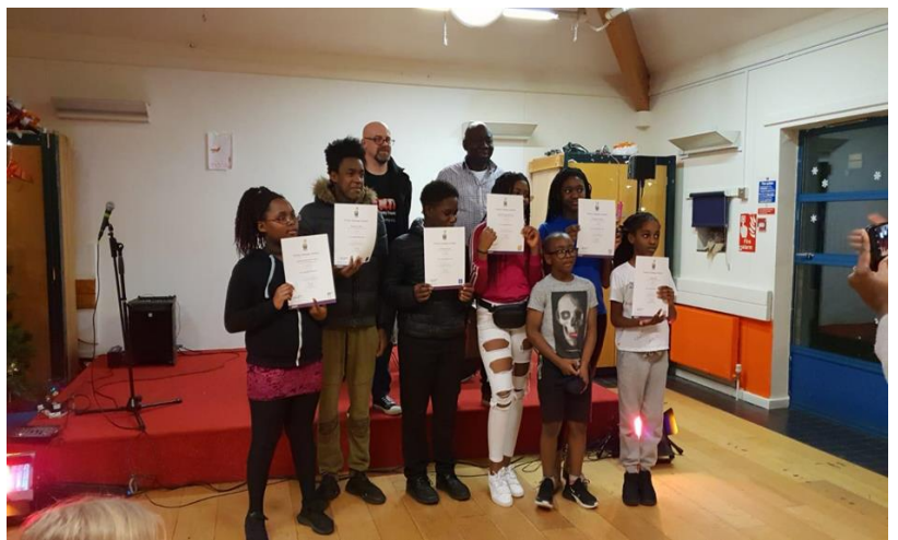
Certificate presentation to those who completed the beginners' music course