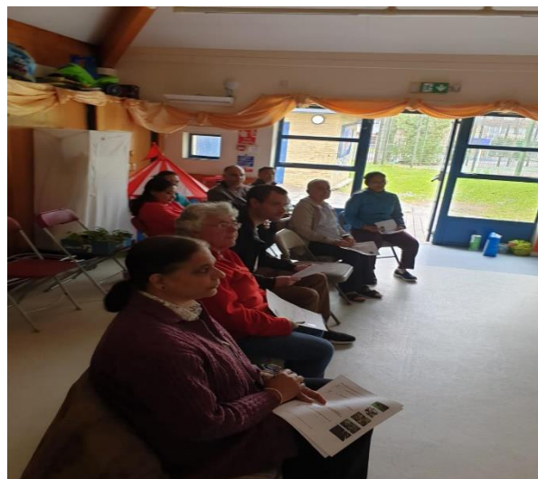
Gardening lesson at Hexham Hall