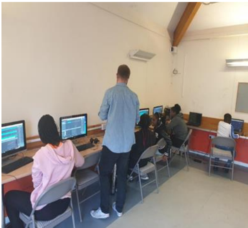
Beginners music session