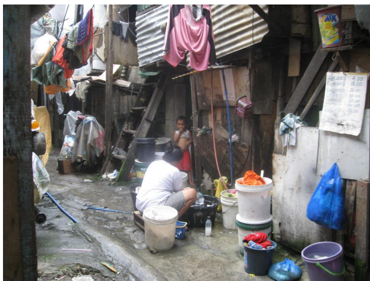
A few squatter homes in Mandaluyong, Manila