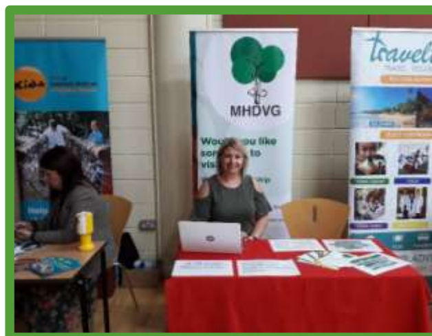
Figure 2 MHDVG volunteer raising awareness and recruiting volunteers at a Lincoln Bishop Grosseteste University's Freshers Week

Our volunteers spoke at three public events on the subject of immigration detention: