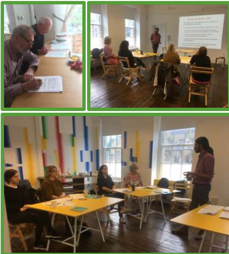
Figure 1 MHDVG and AVID staff deliver training to volunteers in Lincoln and Nottingham 2019