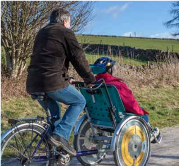
Accessible bike hire route at Parsley Hay

amazing views, moorland expanses, intimate dales, dramatic geology and the history of the landscape. A £10,000 grant from the Foundation is helping to make more routes in the National Park more accessible, sensitively resurfacing eroded footpaths and bridleways and replacing stiles with gates. This work improves accessibility and reduces widening erosion, thereby supporting the conservation of the surrounding habitats and landscape.