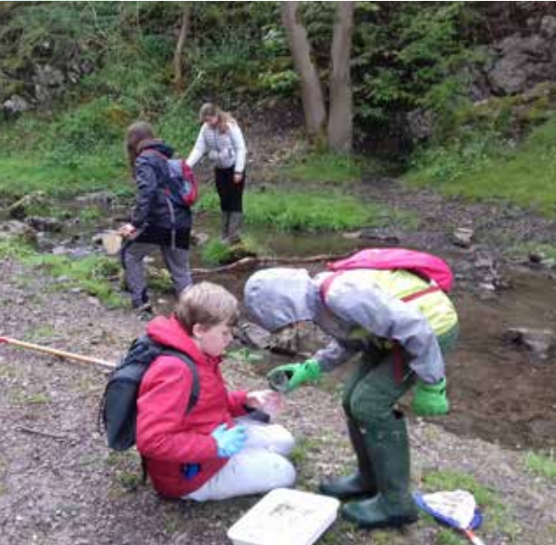
A Junior Ranger session for young volunteers