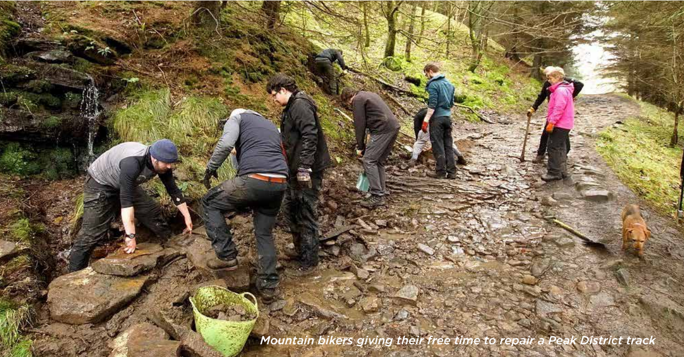
Mountain bikers giving their free time to repair a Peak District track

As part of a network of regional and national trails, they provide easy access, multi-user routes into and within the heart of the Peak District. These popular