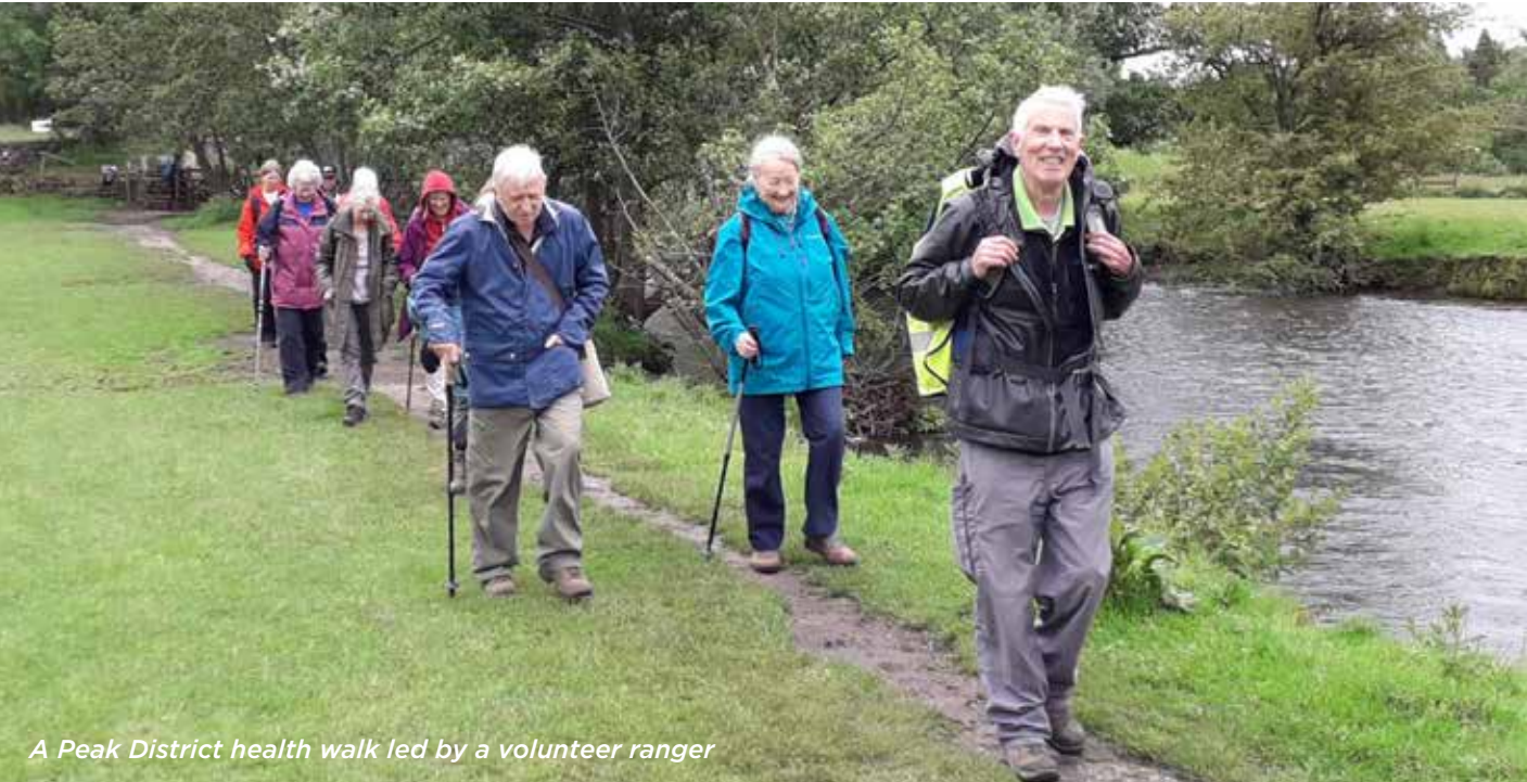
A Peak District health walk led by a volunteer ranger

We all know that a walk in the countryside makes us feel better. Peak District Health Walks provide a monthly minibus and guided walk for people living with long-term health conditions and their carers, who would otherwise be unable to enjoy the National Park. The project has been selected by the Co-op in Baslow to benefit from their Community Fund.