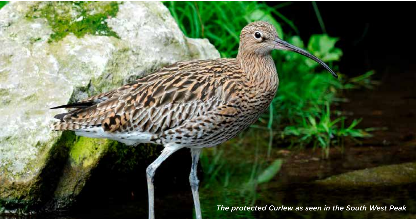
The protected Curlew as seen in the South West Peak

moors offer stunning, wide open spaces perfect for escape and adventure and are enjoyed by walkers, horse riders and mountain bikers. A grant of £10,000 is supporting moorland restoration and research, particularly understanding peat depth. This leads to a better understanding of the amount of carbon stored in these peatlands, the associated wildfire risk and helps to prioritise mitigation and restoration works.