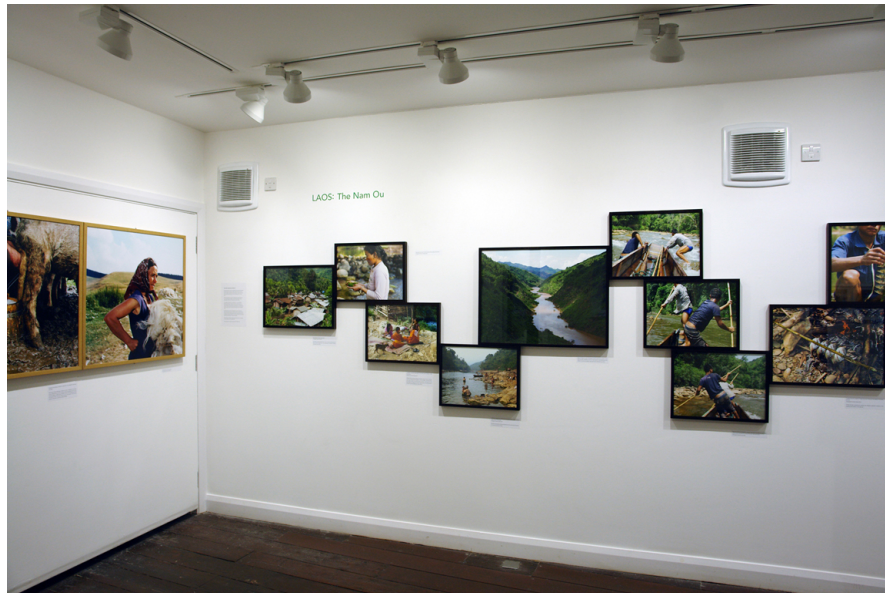
Tessa Bunney's Otherwise Unseen

Rural documentation by Bunney in Yorkshire and South East Asia (January 11th – 5th April 2020)