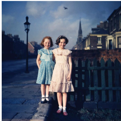
From Jimmy Forsyth's Scotswood Road

Working class photographer documenting his own community as the streets were demolished in the late 1950s and 60s. First shown at Side in 1981 in connection with the book largely developed by Derek Smith. The prints, made for the exhibition, are the best of Forsyth's work. Some of the negs were subsequently lost by Newcastle Libraries. (86 exhibition prints; 42 original 'snapshots' on 4 mounts; 94 exhibition work prints; 70 single frame contacts)