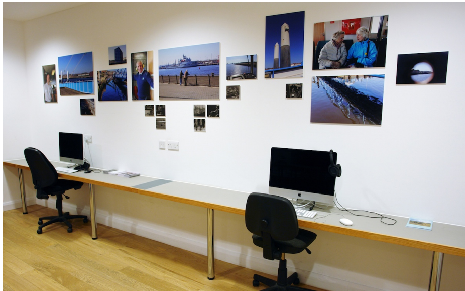
The Shields Ferry Project by Christ Church Primary School, Wallsend