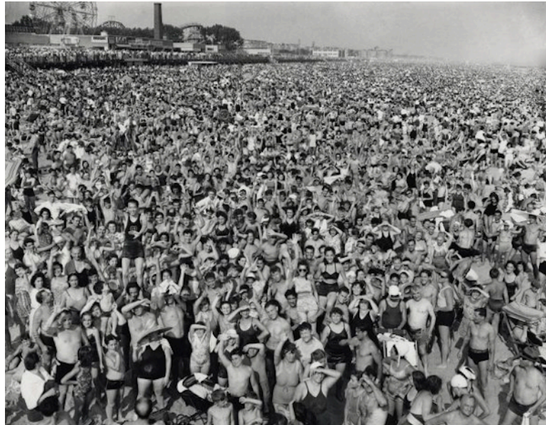
From The Weegee Collection

New York photographer, 1930s - 60s, pioneer of tabloid style photography, he worked mostly within a 1 mile radius of his midtown apartment. Sensation - murders, crime, fires, etc; street scenes, entertainment. (100 primary exhibition prints)