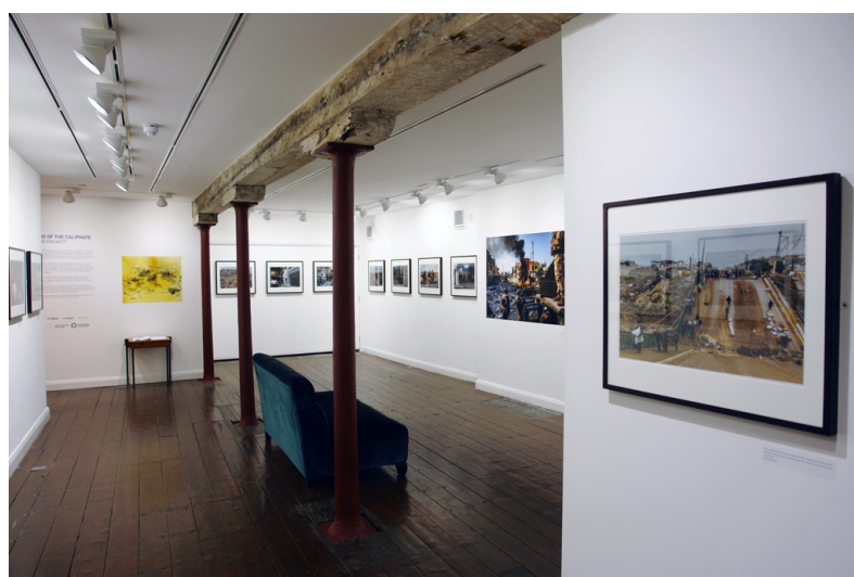
End of the Caliphate by Ivor Prickett

The last days of the Islamic State caliphate in Raqqa and Mosul (28 September - 15 December 2019)