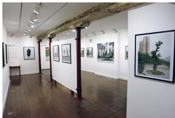
Yan Wang Preston's Forest

Chinese environmental attitudes and development (6 April – 9 June 2019)