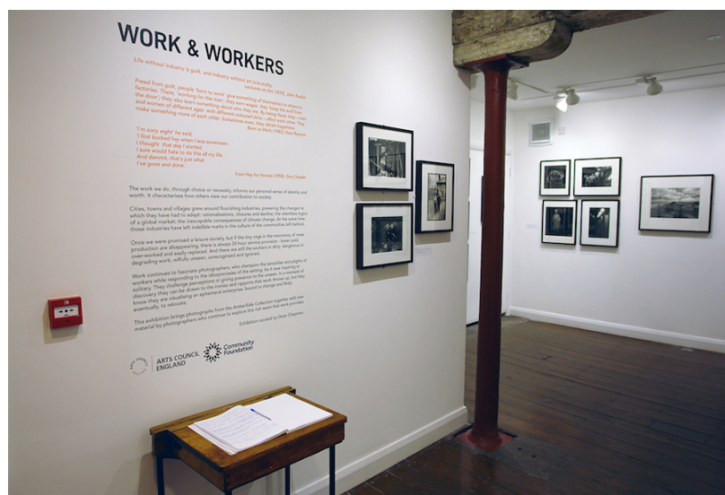
Work & Workers - a 3 floor exhibition