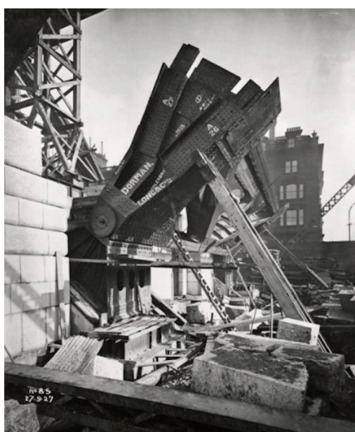
From The Building of the Tyne Bridge

Photographs from the Dorman Long collection documenting the build from 1925 to 28, taken by Grey St company Bacon's, possibly for Philips (later Ward Philips). One of the Dorman Long albums produced has also been deposited. (50 primary exhibition prints, 26 duplicates, 1 album)