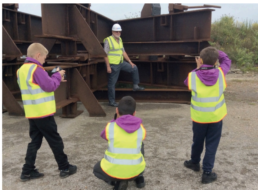
Carville Primary School pupils on their shipbuilding project

2019-20 saw Paul Hamlyn Foundation supported projects at Carville, Collingwood and Christchurch primary schools in North Tyneside, exploring the heritage and contemporary legacies of shipbuilding, the fishing industry and the Shields Ferry. 47 pupils were awarded Arts Award Explore certificates. A film developed from Carville Primary's shipbuilding project can be seen at https://vimeo.com/392037829 .