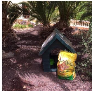
New volunteers maintaining and refilling a couple of our homeless cat feeding stations.