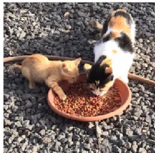
Colony of homeless cats just trapped and ready for next day neutering, mum and one of the 7 kittens we need to help in a few more months.

A 6 week old kitten found alone, sick and starved.