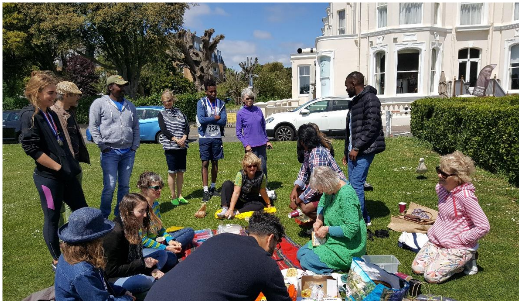
Celebrating achievement with our community, September 2019

RG was invited to the Folkestone Living Advent Calendar in December 2019 where collections were made on behalf of GK.