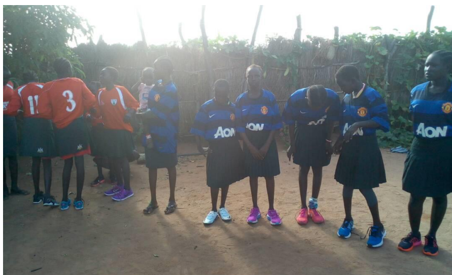
Our girls celebrating their new shoes