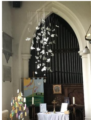
"Come, Holy Spirit" art installation