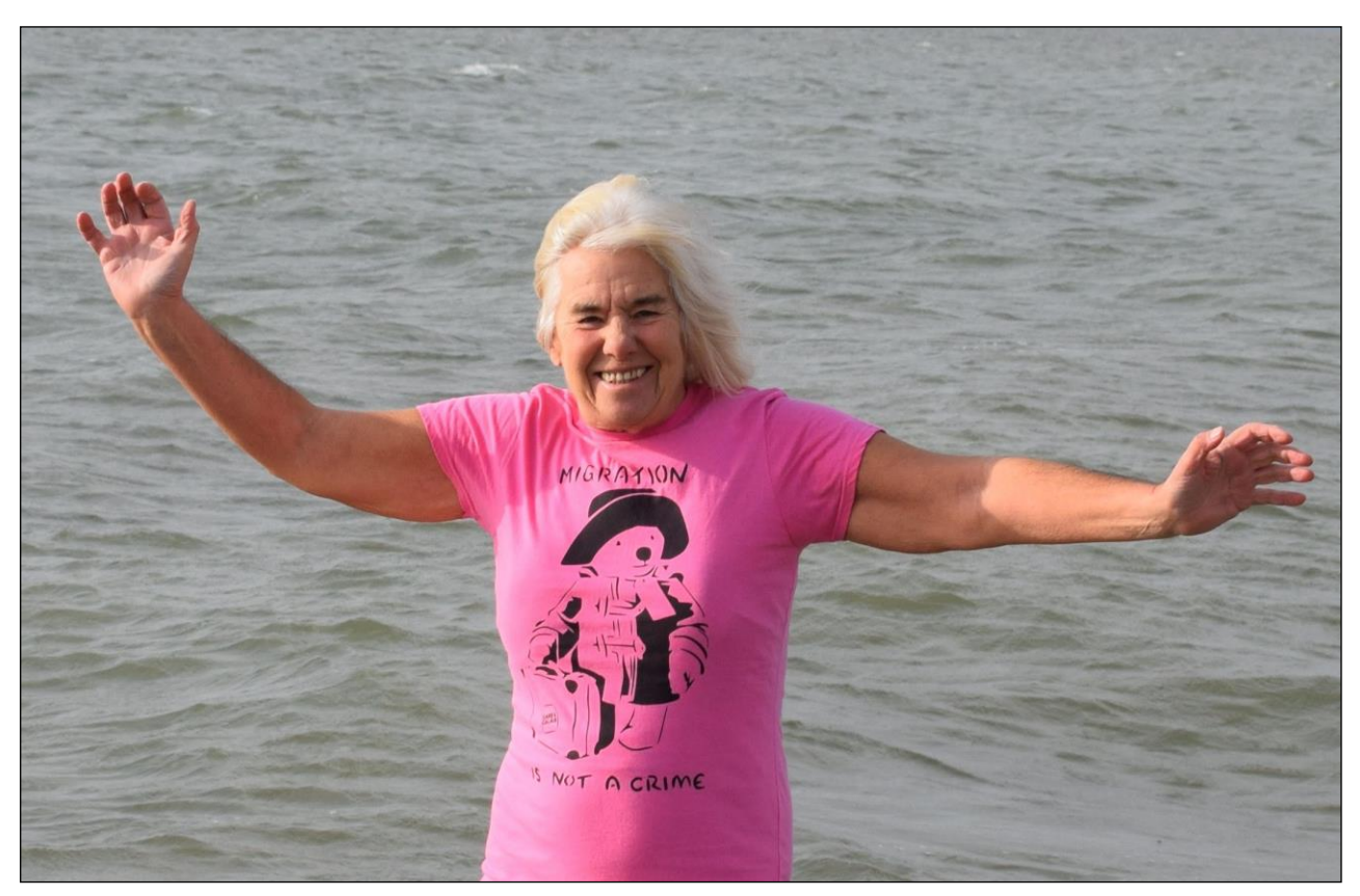
The shirt says "Migration is not a crime"