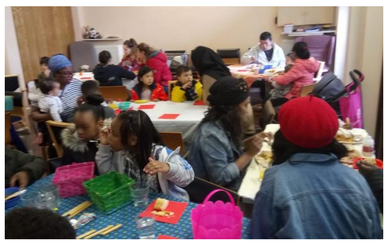
The Meeting Room laid out for food and games

After a walk round the centre of Chichester to see the outside of the Cathedral and the Bishop's Garden everyone made their way to the Meeting House to eat. In spite of the numbers and the tiny kitchen a hot lunch was provided and everyone squeezed in. In the afternoon some went to Friday prayers in the Swanfield Mosque, followed by a football 'match' against Sanctuary in Chichester. For the children there was an Easter Egg Hunt and face