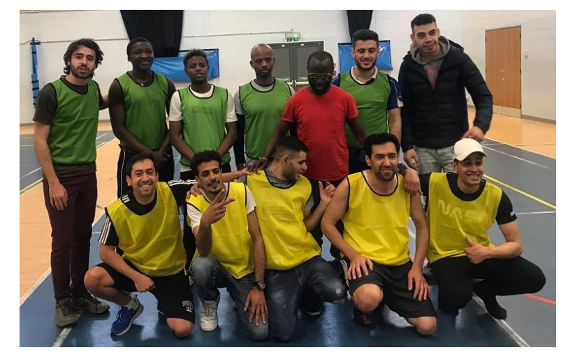
The Friends Without Borders team, March 2019

Illustrated talk Talk and Exhibition Illustrated talk After lunch talk Trip for Quakers and Refugees Exhibition Appeal Refugee Week Vigil Refugee Week Talk Feast Appeal Lecture Lecture and Discussion Film and Discussion Multi-Faith event Talk Concert Appeal Talk, appeal