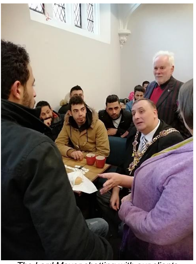
The Lord Mayor chatting with our clients

In the Treasurer's Report (over the page) you will see that £59,673 (82.24%) went to the needy and £12,889 (17.76%) was spent on "administration": rent, phone bills etc. That's a proportion to be proud about.