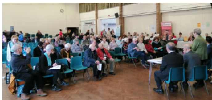
A packed audience at the Winter Fair held at Enfield County School for Girls

Commissioning Group for financially sponsoring our successful Winter Fair and Falls Prevention Days, attended by some 500 people.