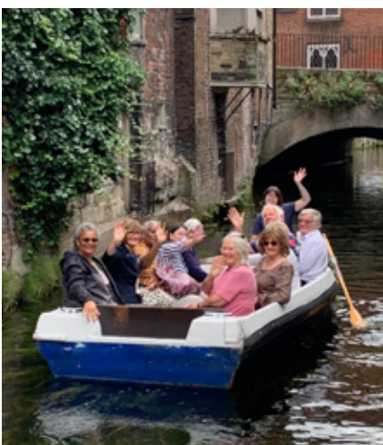
Day trip to Canterbury and the boat ride on the Stour

The forum is so lucky to have such a dedicated and enthusiastic SET and so that we can continue to increase our offerings, come and join us, even for one event per year, every little helps.