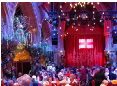
Members trip to Brick Lane Music Hall

The SET are a dedicated group and are always looking for new and challenging destinations to keep the membership happy. We are already planning for the coming year and beyond, so please keep supporting our efforts as it gives us feedback that we are getting it right!