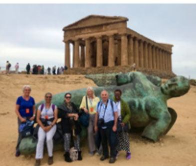
Group holidaying in Sicily