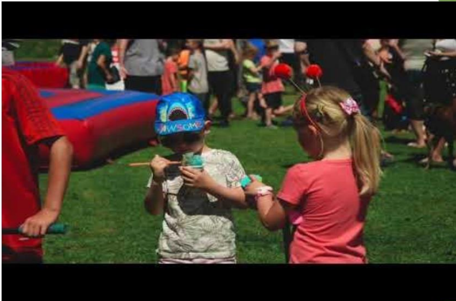
Summer Festival 2019