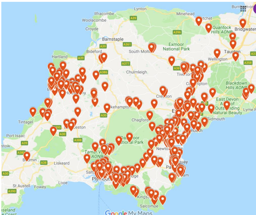
2018 activity map