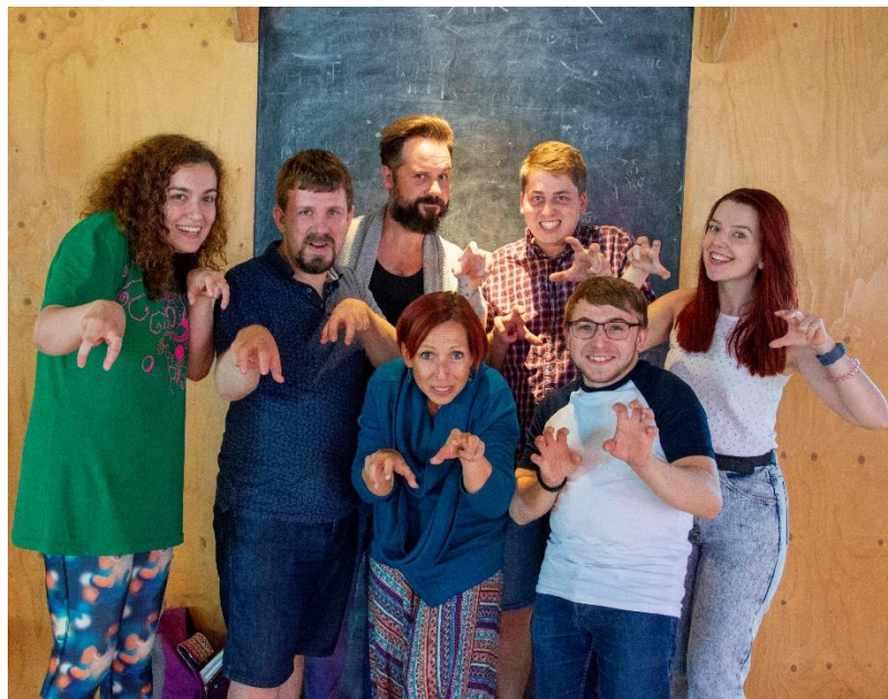
You've Got Dragons re- rehearsal at WMC

Following on from the success of You've Got Dragons (our family show exploring mental health- opening conversations and tackling stigma) in 2018 and early 2019, we were commissioned by The Wales Millennium Centre to be the resident show at the centre over the Easter Holidays 2019. We did 2 shows and workshops every day for a week- all of which were sold out- indeed we had to add in an extra workshop each day to meet demand from families. The family show (featuring 3 Deaf and 1 hearing performer) was then one of the small number of shows selected by House Theatres to be supported by them to tour England in Autumn 2019 as a core part of their programme. House Theatre is an initiative run by ACE and Farnham Maltings supporting venues in the SE of England to book and programme quality theatre. Being selected by them is a mark of quality as well as a financial boost. This family show therefore undertook another England tour which included many new venues in SE England like Ropetackle Arts and Broadway Barking. The total audience figs for Dragons during this period was 2984 with hundreds attending family resilience building workshops devised by Deaf clinical psychologist alongside our Dragons team.