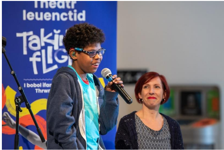
Youth Theatre Launch Feb 2020, Wales Millennium Centre