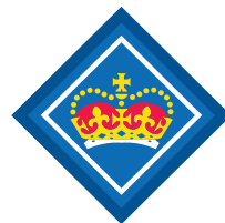
Queen's Scout Award, 13 recipients