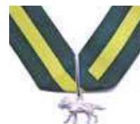
Silver Wolf Award, 2 recipients