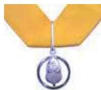
Silver Acorn Award, 10 recipients