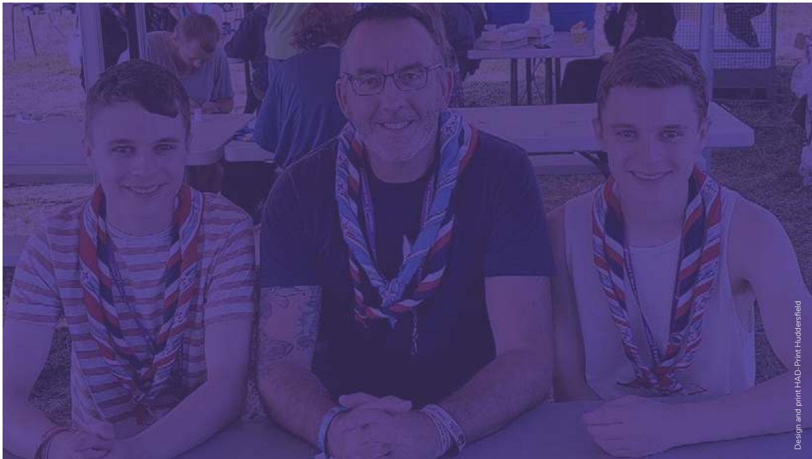
Design and print HAD-Print Huddersfield