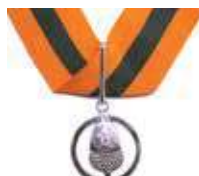
Bar to the Silver Acorn Award, 1 recipient