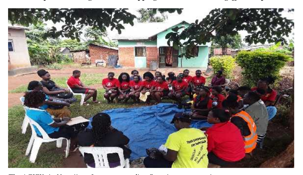
The AGYWs in Nagojje safe space attending Stepping stone session.

Below is a photo showing one of the stepping stone sessions in Nagojje safe space.