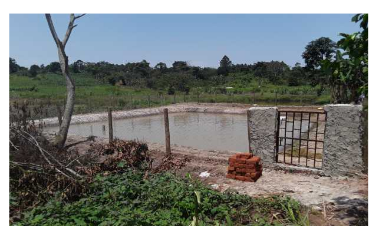
The photo above shows the outside view of the Fish pond