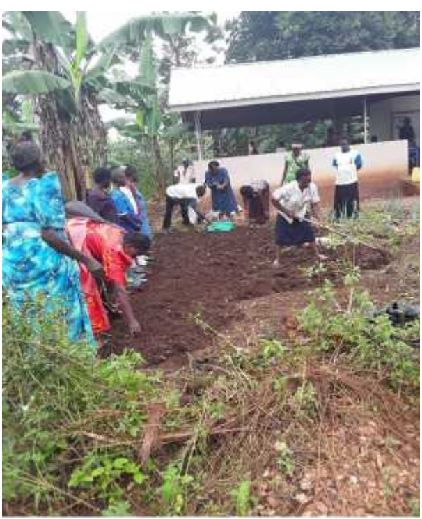
The photos above show OVCs and their caretakers during one of the backyard trainings in Ntunda subcounty.