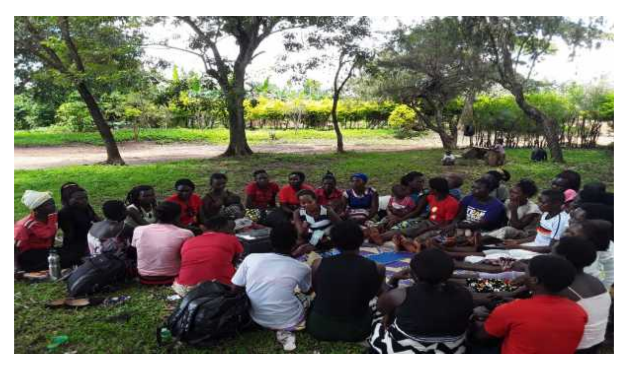
Twezimbe VSLA group at Kyabazaala safe space during one of the sitting