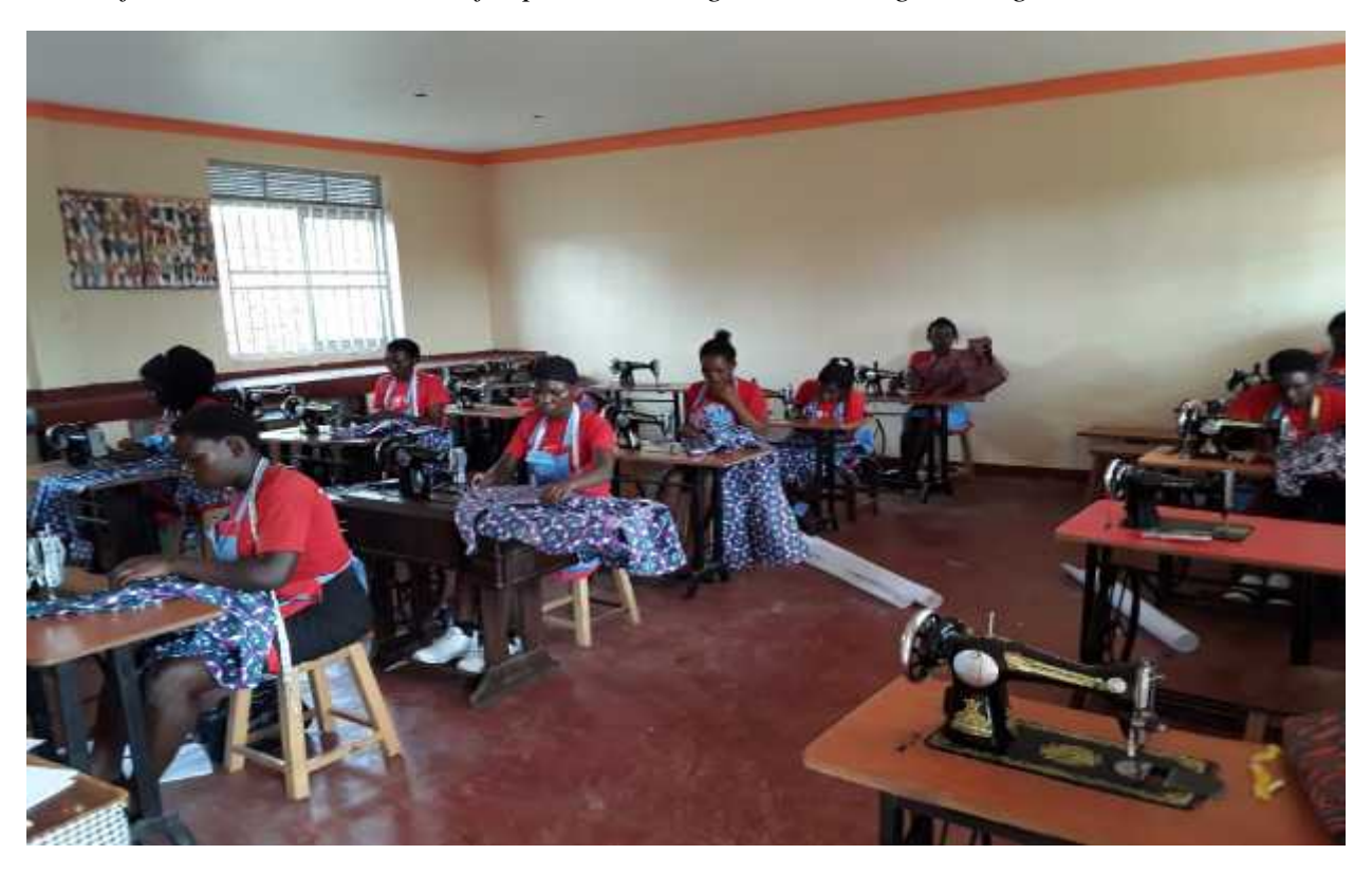
Some of the AGYWs in Buliika safe space attending a tailoring session.