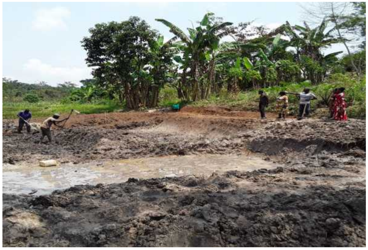
Empowering Young Mothers