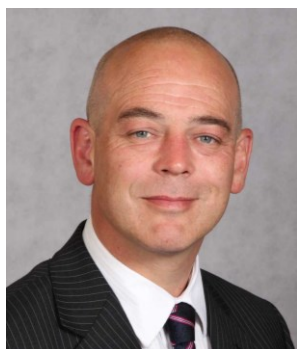
The Deputy Mayor of Wolverhampton Councillor Greg Brackenridge (Deputy Chair)