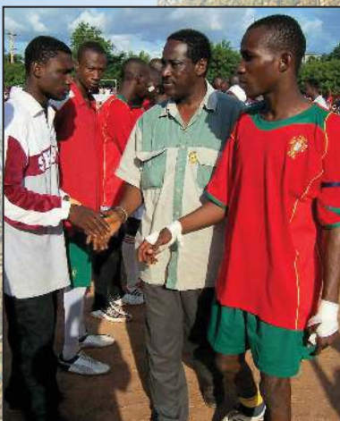
Yanfolila football team