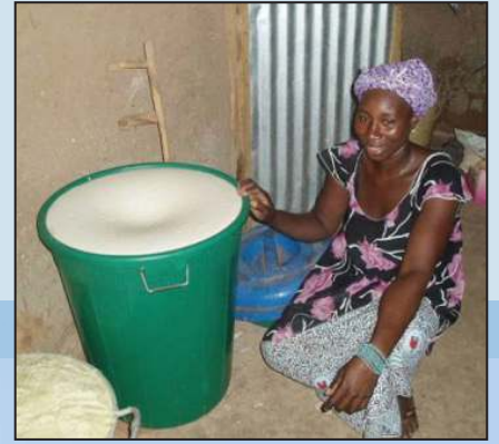
Shea nut processing into shea nut butter