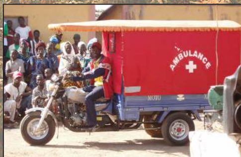
Provision of an ambulance to Bougouni Health Centre