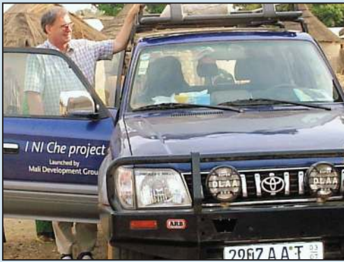
Donation of a 4 x 4