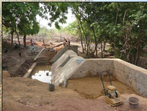
Construction of a dam, Mafélé