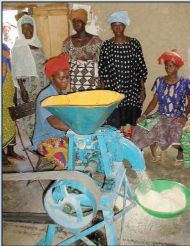
Grain grinding mill