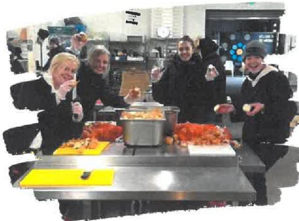
With Herts for Refugees volunteers at RCK, Calais