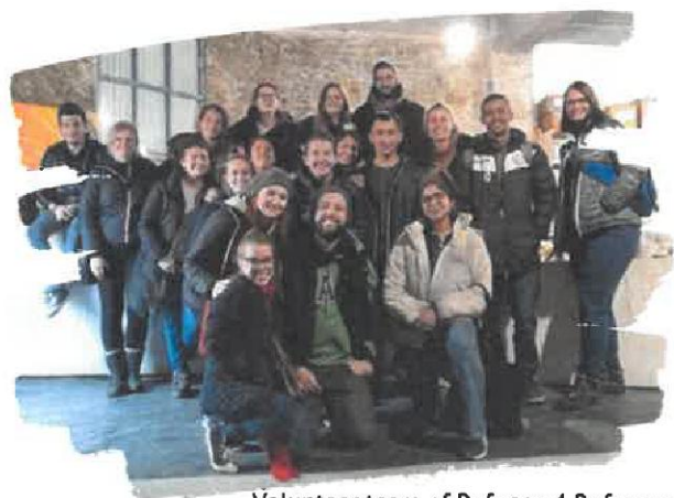
Volunteer team of Refugee 4 Refugees

Experiencing again the difference being made to so many lives by the actions of volunteers, including many refugees themselves.