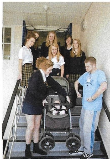
Life-skills in action from Straight Talking Peer Education