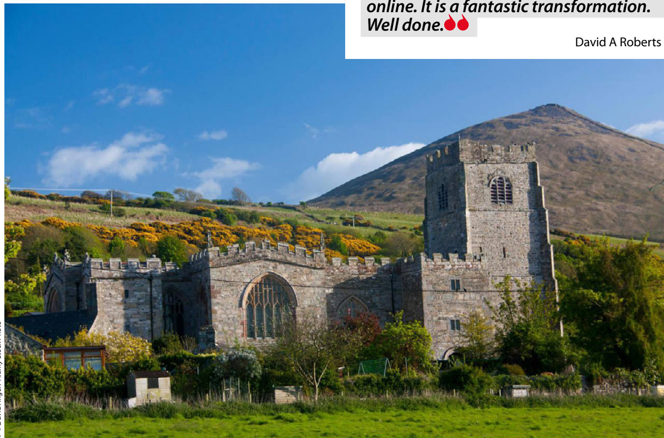
St Beuno's Church, Gwynedd, Wales, on the pilgrimage route to Bardsey Island.