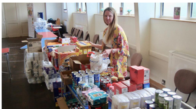
Food bank at Mount Merion Church.

In October a new training session was trialled for new grantee churches. This allowed attendees to find out about how we support churches including advice on fundraising, promoting churches to tourists and visitors and on using our MaintenanceBooker service. This training session will become a regular session in 2021.