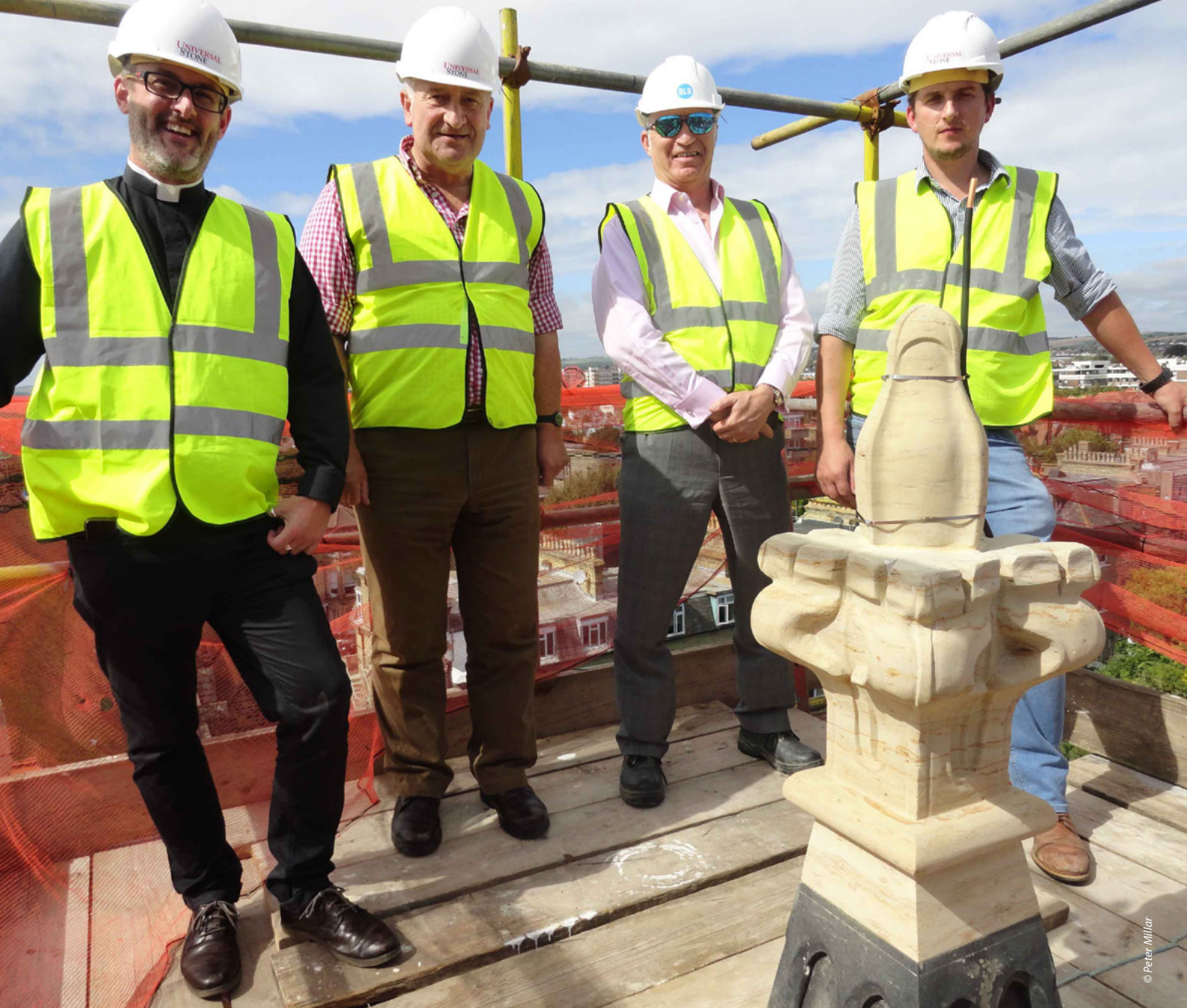
Celebrating the completion of work to restore the two east towers of All Saints in Hove, part funded by a £40,000 National Churches Trust grant.