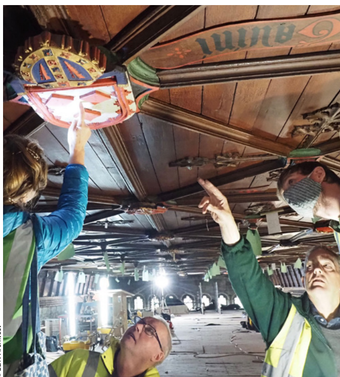
Examining one of the 48 heraldic shields on the ceiling of St Machar Cathedral in Aberdeen.

The good news for the other three churches that were shortlisted for the Friends' Grant in 2020 is that, in recognition of the exceptional challenges posed by Covid-19, they all received a Friends' Grant. St Peter's church, Appleshaw, Hampshire, the runner up, received £5,000 and the other two churches, St Nicholas, Churchstoke, Powys and St James, Leckhampstead, Berkshire each received £2,500.