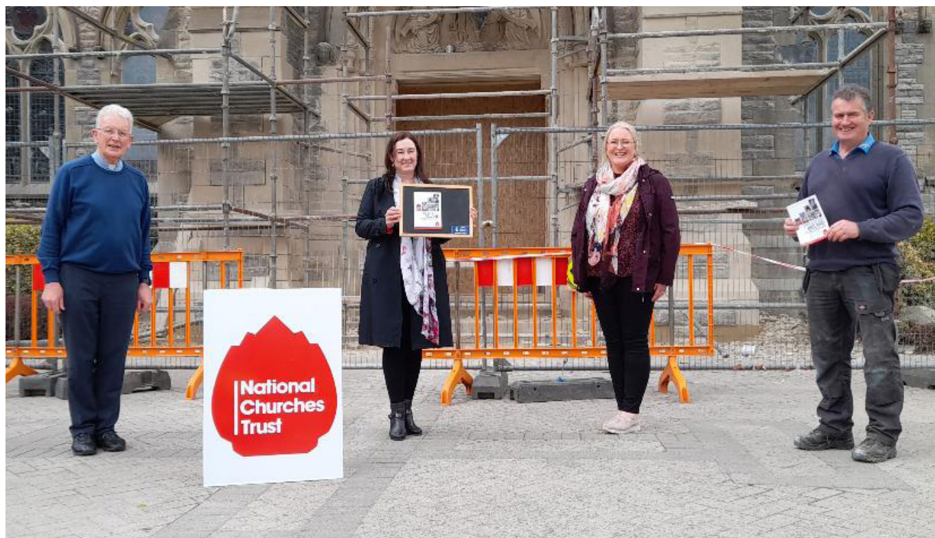
Celebrations at the Church of the Immaculate Conception, Strabane, Northern Ireland, which was awarded a £7,500 Repair Grant from the National Churches Trust 'Treasure Ireland' project and a £2,500 Wolfson Fabric Repair Grant in 2020.

In 2021, we will continue to provide Preventative Maintenance Micro-Grants to fund up to 50% of a project (excluding VAT) and to a maximum of £500, towards the costs of fabric repairs booked through our MaintenanceBooker service.