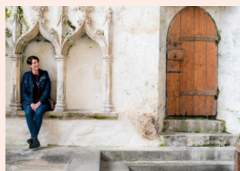
St Beuno's Church, Gwynedd, Wales

I also work with volunteers and clergy to encourage them to open their churches to visitors. I love delivering training, sharing good practice and seeing the positive benefits which come from opening the doors to churches and telling their stories imaginatively. Most recently, of course, the training has been delivered online; that has been a real success story with more people able to attend regardless of where they are based.