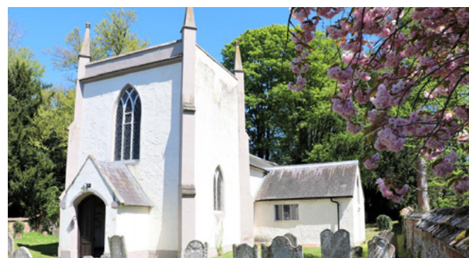
St Peter's church, Appleshaw

I have been a member, with my wife, for three years and it has been a very positive experience and that is because you and all around you are positive. The principal reason for writing is to support you entirely in your views that church buildings are most certainly not an irrelevance, quite the opposite.