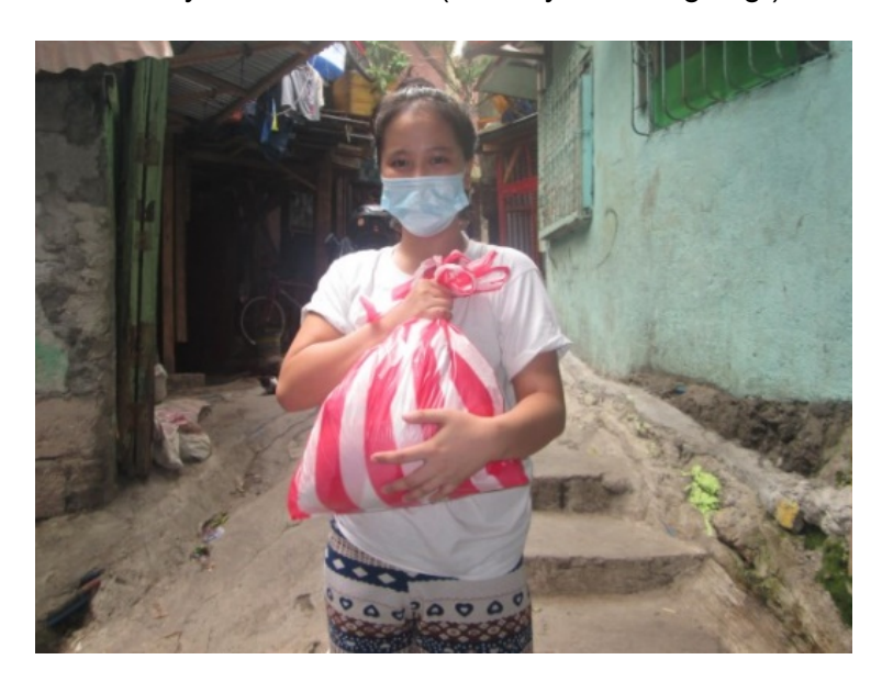
Emergency food parcel that has been vital during the pandemic to feed families and children

God bless you and salamat! ('thank you' in Tagalog!)