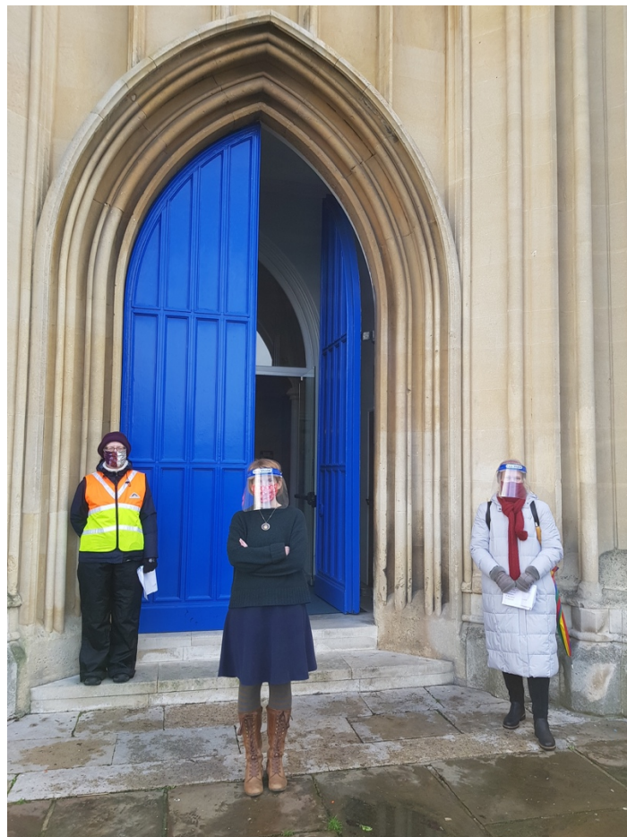
Winter food distribution at All Saint's Church

Annual Report for the year 2020 Published June 2021