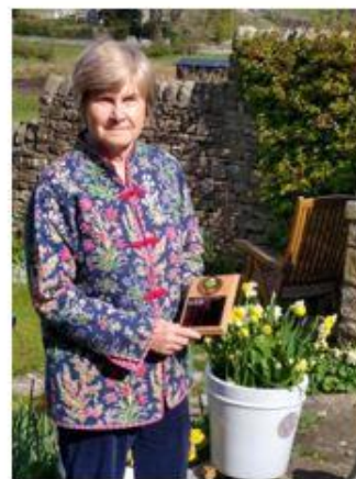
Mickleton Gardening Club Trophy winners, 2020

We were unable to hold our usual September show, so asked members to submit photos of garden produce, along with pictures taken by garden judges, to create a slide show for when we were able to meet again.