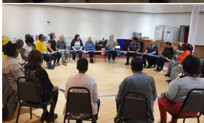
Some of our Older People's PILOT Fitness Activities During COVID-19 Restrictions