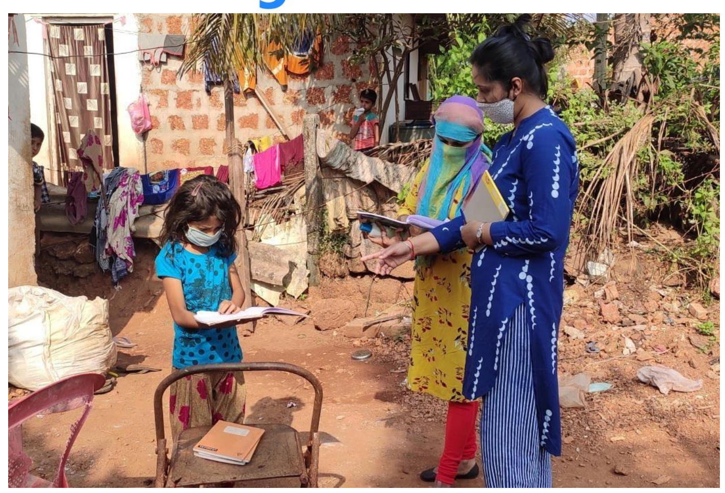
2020/21 Annual Report & Accounts