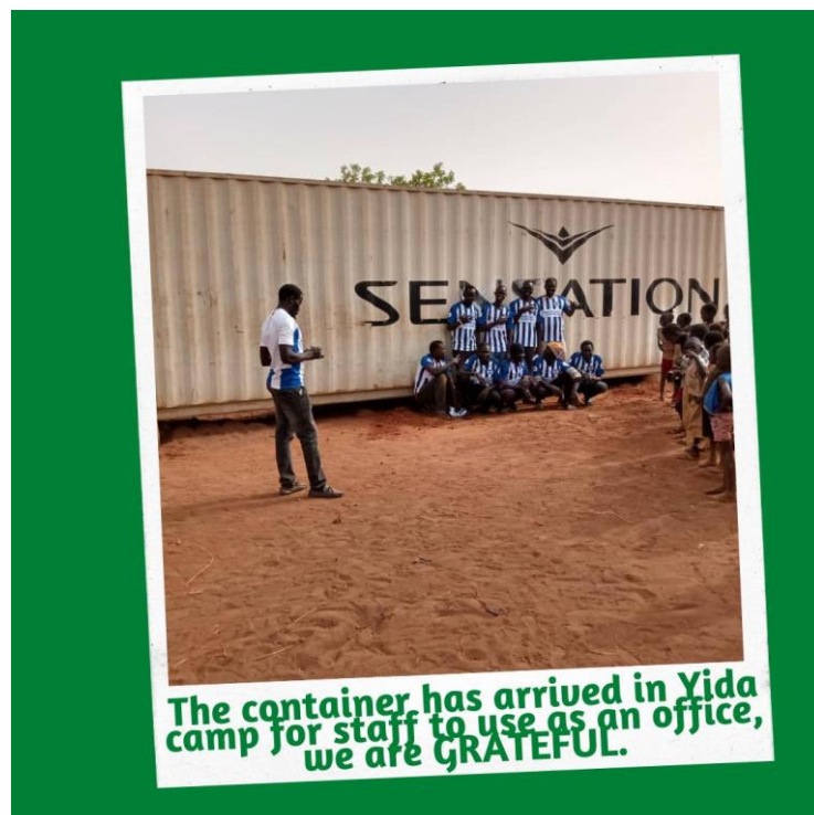
40ft shipping container to serve as on-site storage - a gift from Legacy donations for Yida

Following successful negotiations with the local government, GK has been allocated a bigger space in the camp. Our senior coach co-ordinator now lives in the GK space and we have also obtained a 40 ft shipping container to provide storage for our sports equipment and supplies. The recent improvement in the compound has raised spirits, particularly the gift of the container. With the enhanced space available we are working towards a new build with appropriate sanitation facility to improve the hygiene facilities for the children we work with. The additional space helps us to meet the needs of more children and young people and will be invaluable when we can fully return to our sports programming.