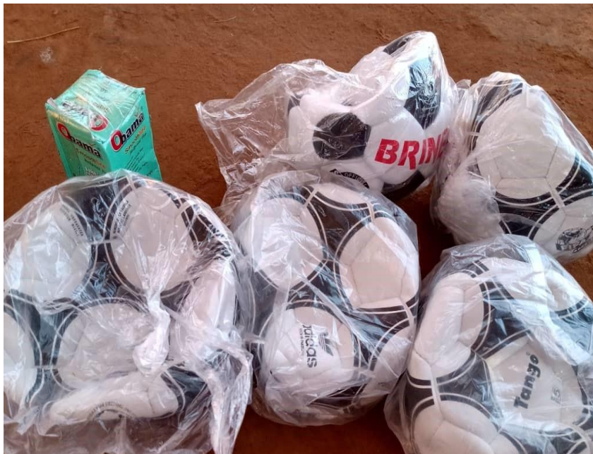
Thank you for the football, it brings me so much joy!