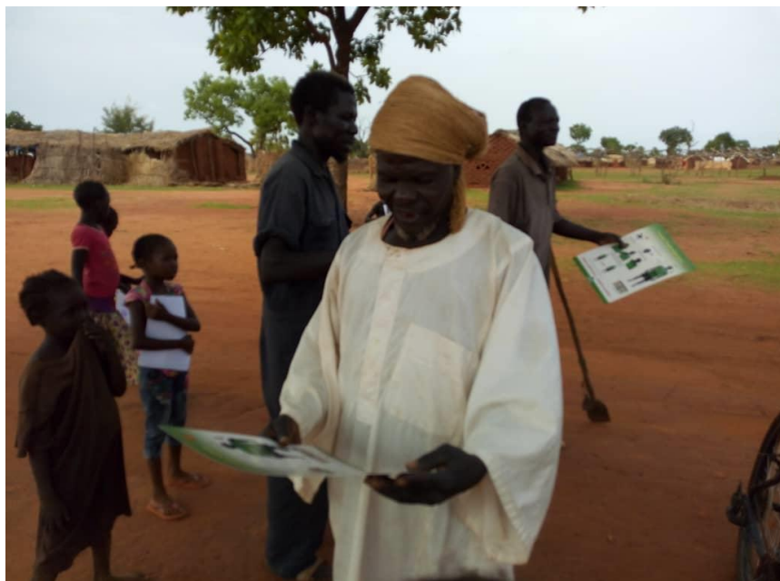
COVID-19 poster drawing images is courtesy to Aida Silvestri