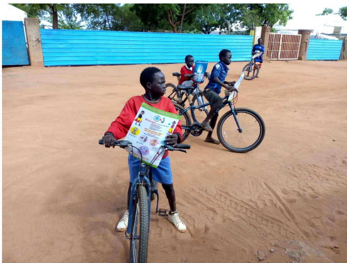
COVID-19 poster drawing courtesy of Darrie Payne