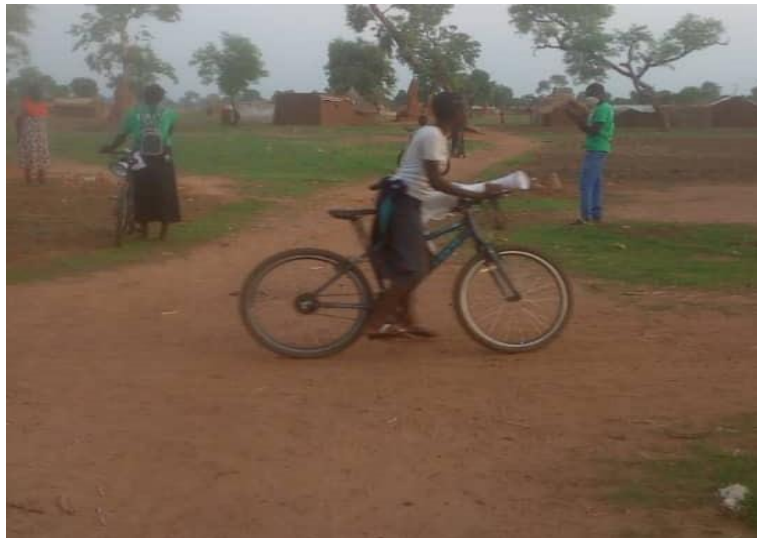
Volunteers distribute leaflet & soaps to reduce preventable hygiene-related diseases

The young people we work with distributed the leaflets, many using the bicycles we sent to the camp following our fundraising efforts in previous years.