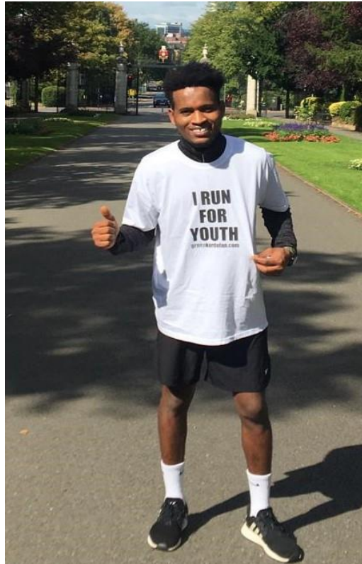
Asme raising funds for GK Sept- 2020- The two cities Run!