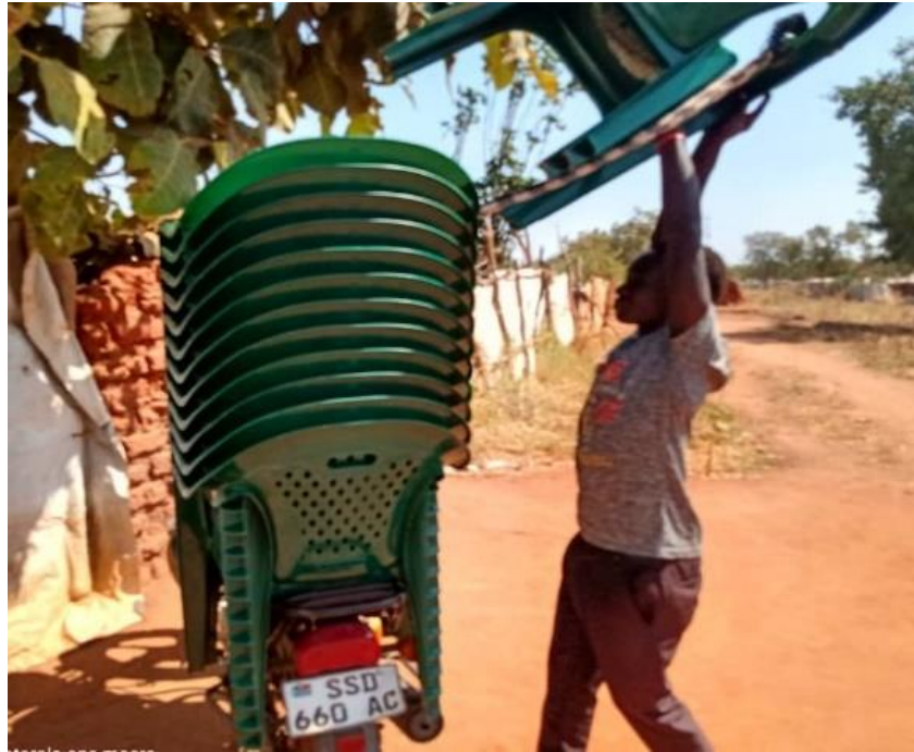
New workshop chairs