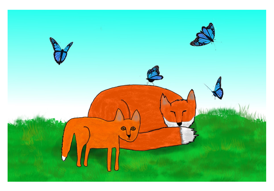
Card designed by one of our young voice members

Prior to March, our numbers were holding up well and we had a waiting list. Sadly the small number of session we have been able to run this year has had a reduced attendance, particularly with our youngest age group. Our Step up group (11 - 18) has seen 10 to 12 turning up which is quite good. Our Young Voice (4 - 11) has only had 3 to 4 attending. This reflects concerns of transmission etc. similar to the concerns now being expressed with schools.