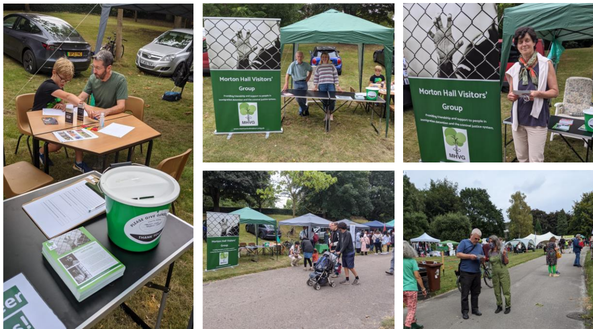
Figure 2: MHVG exhibiting at Nottingham Green Festival in September 2021.

We have a very good relationship with AVID, and we have attended regular AVID coordinators' meetings in 2021. This has been a vital exercise in sharing information re: the rapidly evolving nature of the detention estate, as well as providing an opportunity to share and learn from best practice with other visitors' groups, (15+), across the UK.