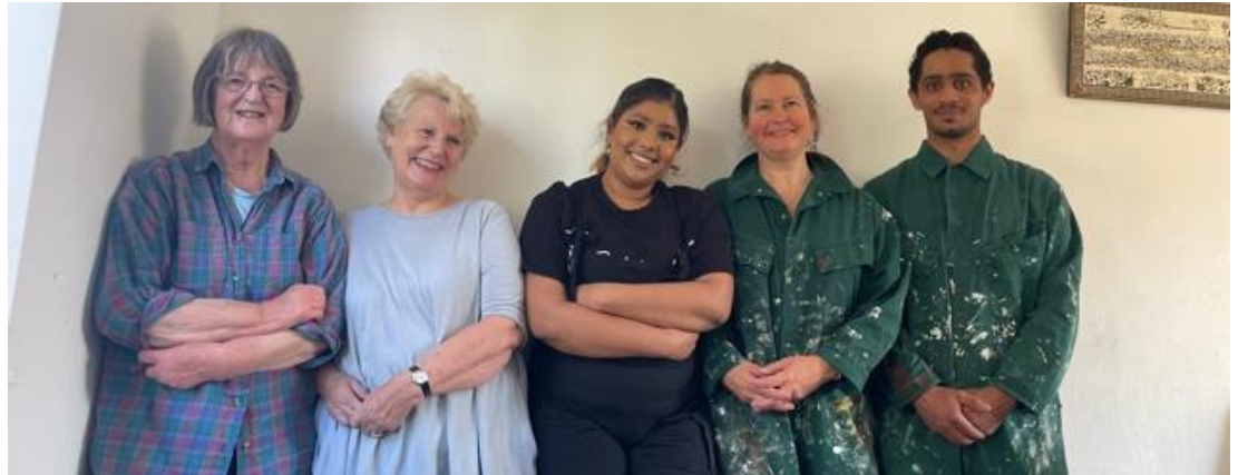
A happy team after a long and successful day of decorating.