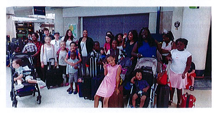
Venture Fresh Expressions Mummies Republic Butlin's 2019 retreat

A further achievement was the annual retreats initiated to mitigate the scourge of poverty around the summer holidays. In the words of one of our members "This summer my child can report back to school, that they did more than go to the playground". This annual activity began in 2016 as a learning outcome from the group therapy classes and ceased due to Covid-19.