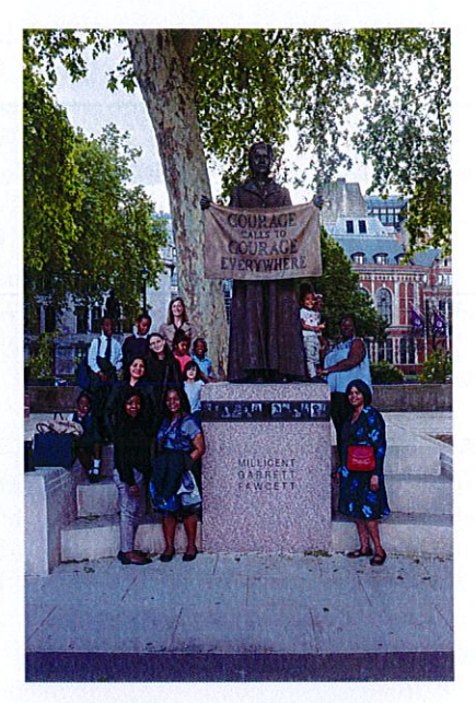
Venture Fresh Expressions Mummies Republic Universal Credit campaign 2019

It took great courage for our members to stand in front of a collective of politicians, heads of housing associations, national campaign senior leaders and headteachers in the Houses of Parliament, impart their experience of the racial and gender biased nature of the policy and its egregious attack on households, simply for they being poor. Courage for the members came in knowing that nothing but policy change would improve the system.