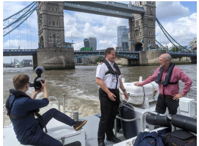
Filming for Bermondsey and Proud and Thankful

As the year went on it was encouraging to see things re starting and opening up opportunities for sharing the gospel. School assemblies resumed in person. Men's breakfast returned as did Bermondsey Brew, Wednesday night Church and RSG at St Anne's.