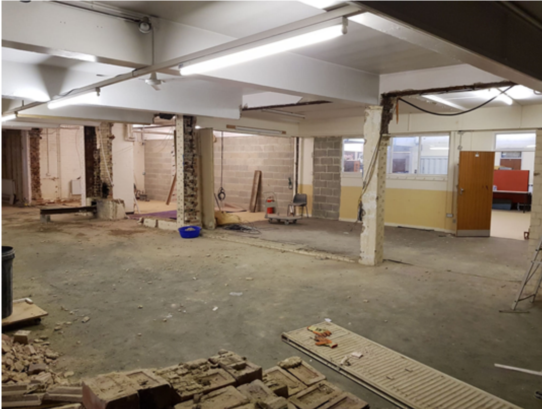
Demolition of boundary wall to extend 2nd floor Darbar in progress