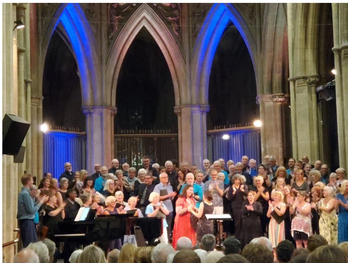
The Landmarks three choirs come together for an end of term public performance.