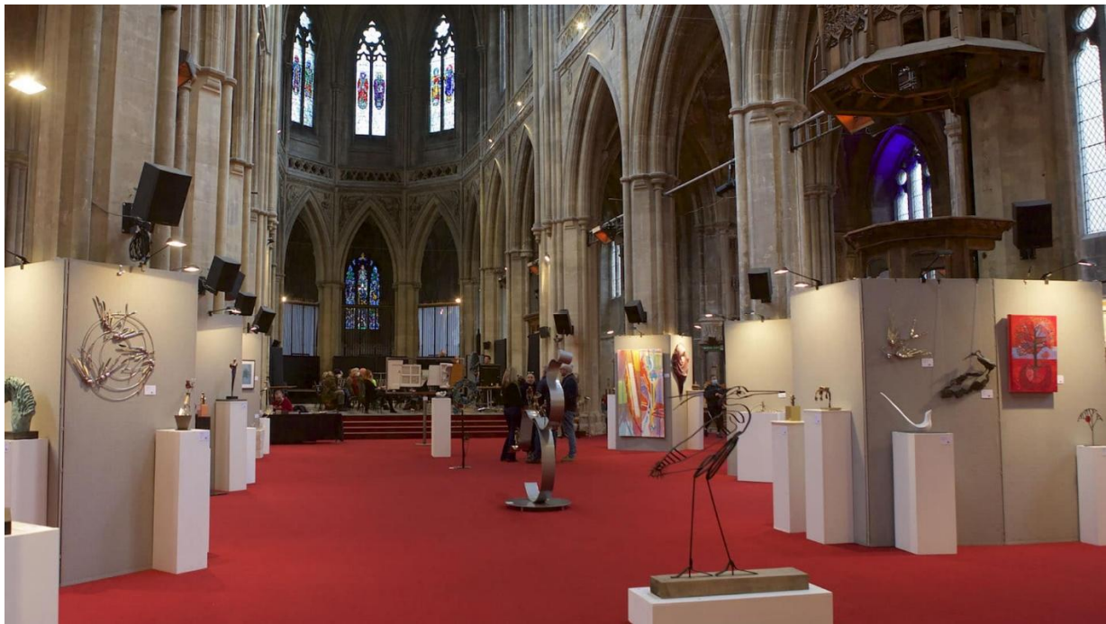
Setting up for one of our Arts Exhibitions