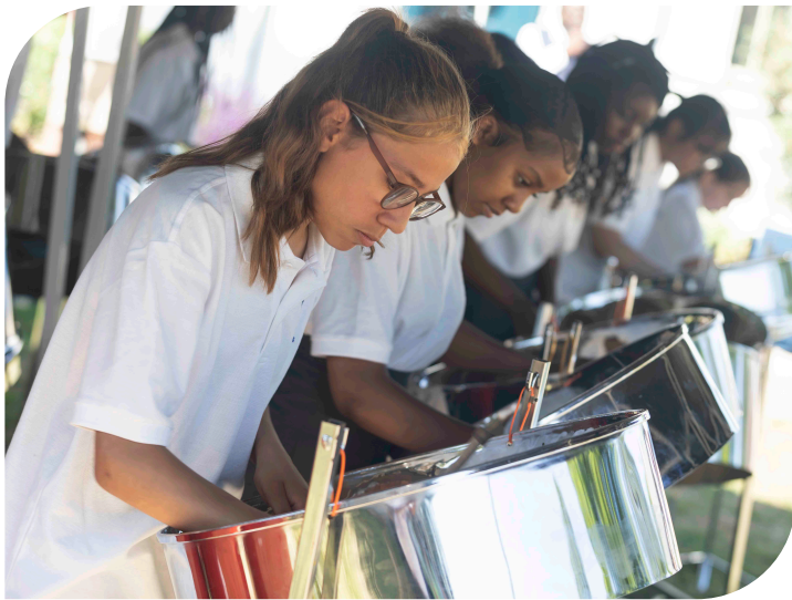
School-O-Rama Festival returns after 2-years