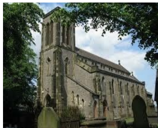
St John's Church, 1840. Grade 11 listed in May 2009 following application by St John's Church Preservation Group

(e) to advance in life and help young people through providing support and activities which develop their skills, capacities and capabilities to enable them to participate in society as mature and responsible individuals.