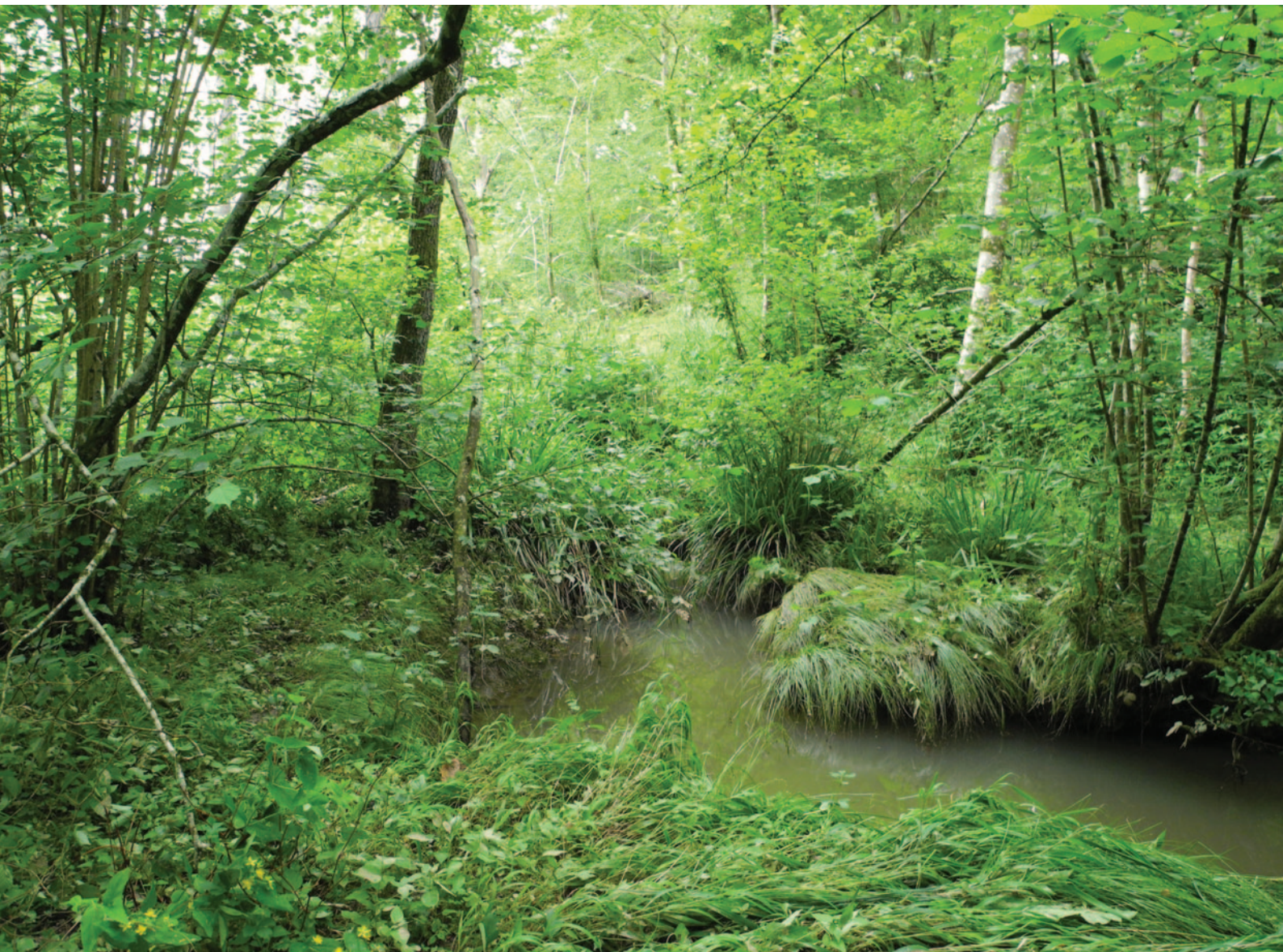
Willand Wood