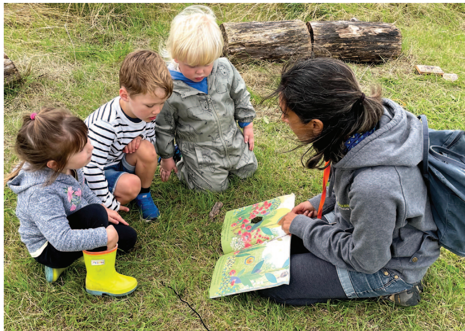
Nature Tots © Kt Bruce

A provision for impairment of trade debtors is established when there is evidence that the amounts due will not be collected according to the original terms of the contract. Impairment losses are recognised in the SOFA.