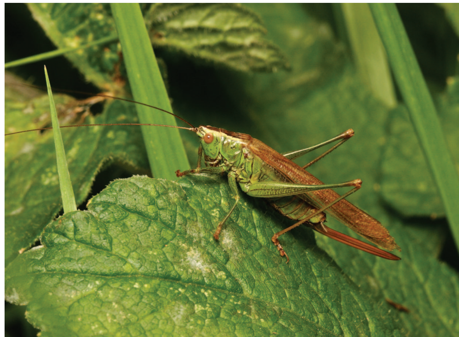
Conehead © Neil Fletcher