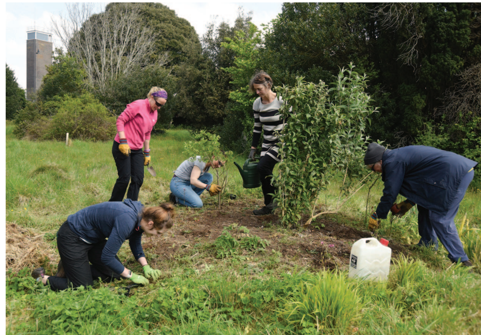
Volunteers planting for wildlife at Broadwater Cemetery, Worthing

At the end of March 2021, it was announced that the Sussex Nearshore Trawling Byelaw had been implemented and Sussex Wildlife Trust joined with others to create the Sussex Kelp Restoration Project. The focus of this group is to enable the recovery of marine ecosystems over 300km 2 of Sussex seabed – eventually we hope to see much of this as kelp habitat (large seaweeds that support a multitude of species). Benchmarking and monitoring the process was the priority for the year and we worked with NGOs, public bodies, local sea-users and academics. The enthusiasm for the kelp recovery has brought together existing and new organisations for Sussex marine and coastal restoration work, and we were selected to receive funding from the Environment Agency to establish the best ways for us all to work together. Weather conditions meant that we could not deliver as many Seasearch dives as we would have liked, but those that happened collected eDNA samples to inform the kelp monitoring work.