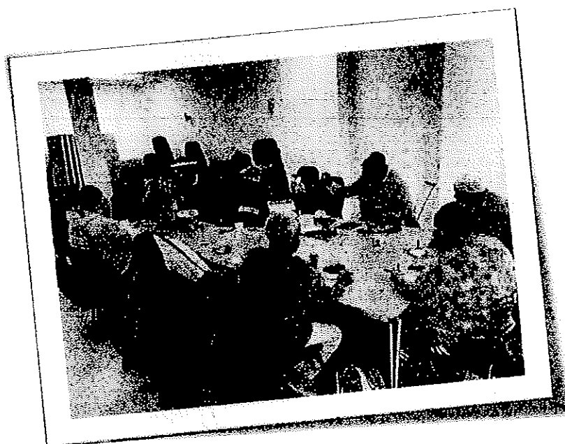
The Blossom Together Project facilitated weekly Discussion Sessions including Wellbeing Workshops.