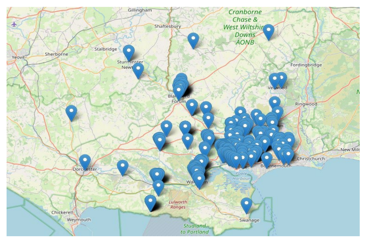
Disposition of Hedgehogs entering the Rescue