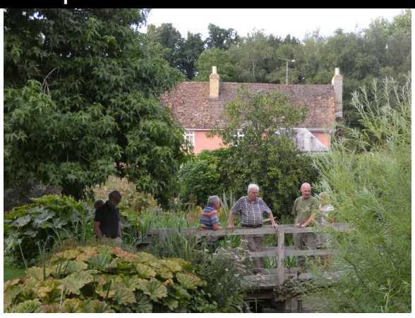
RLCP's 2022 Summer Garden Party at the beautiful Fuller Mill Gardens