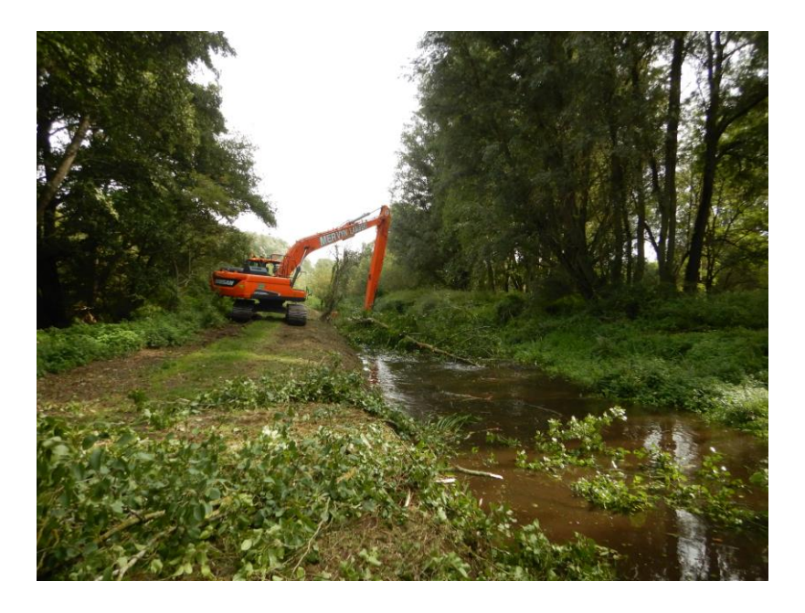
Big machinery placing tree ledges for flow deflection at the Alder Carr reach at West Stow, October 2022

Much to our satisfaction, flow diversity is already creating much more interesting pathways and local scour of the fine sediment that hitherto dominated the reach.