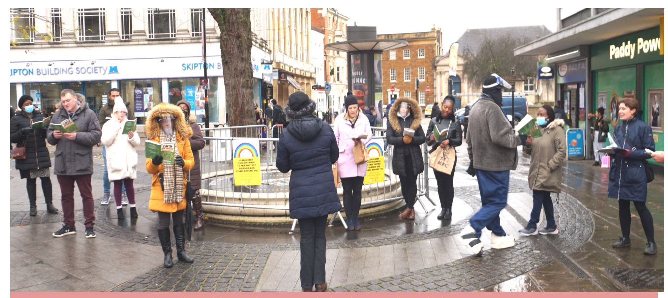
Equipped 4 Life students carol singing on the Christmas outreach. A fruitful morning of sharing God's love with shoppers in Northampton at which many people were prayed with and some giving their lives to Jesus. Many requested to be contacted by a Christian.