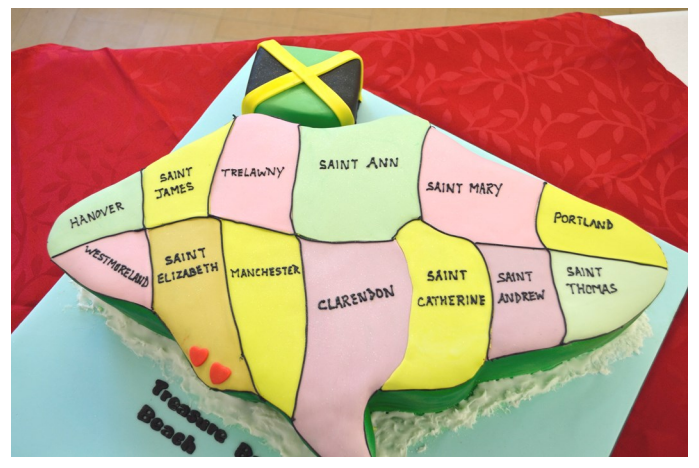
A Birthday cake made in the shape of the island of Jamaica showing the different Parishes.