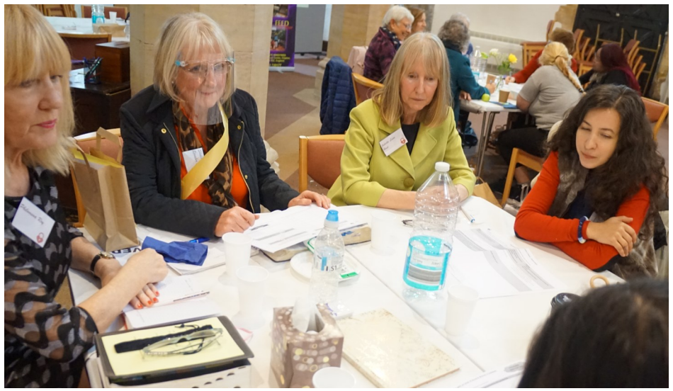
Delegates discussing important issues that are close to their heart.

Ladies out of Lockdown 2 surpassed expectations with delegates spending a day in the presence of the Lord, being empowered and repositioned with renewed confidence and release into the next phase of their lives and ministry.