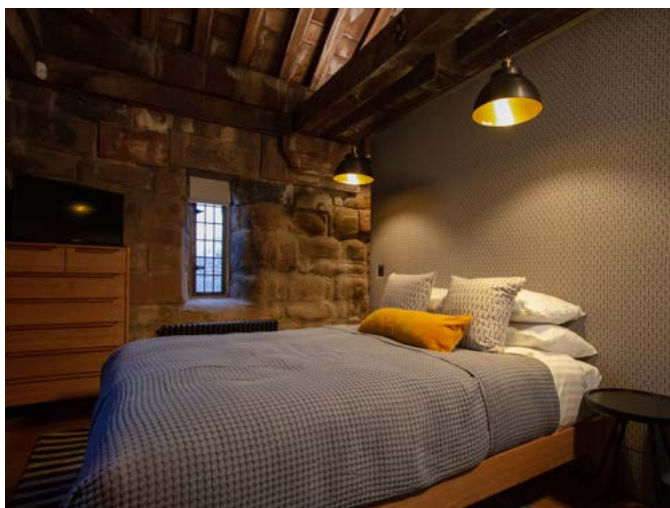
Timeless quality inside the newly conserved Cook Street Gate.

The properties are now available for short stay lets and provide a high-end heritage experience for city visitors, boosting the tourist economy.