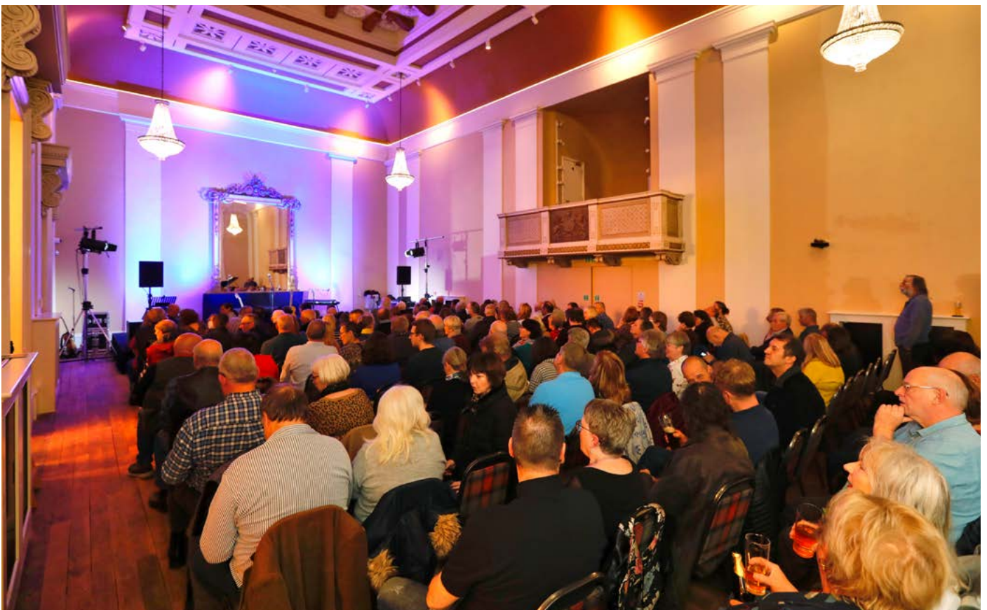
With Covid restrictions over, the series of concerts at Drapers' Hall proved very popular.

There is positive news on the revenue generating projects. The visitor accommodation at City Gates and Priory Row is already having an impact on the city's tourism providing a high-end offer that is helping to change perceptions of the city. Initially externally managed at a net loss, we changed our operating partner after the year end and now have secured a firm positive revenue stream over the next three years. Similarly, pro-active management of the Burges/Hales St properties is reaping benefit with restructured leases improving the recovery of maintenance costs and also increasing rents.