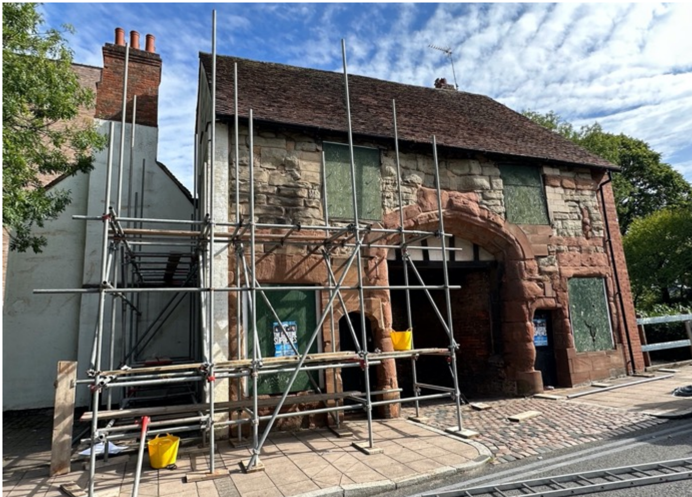
The scaffolding goes up as work starts on restoration of the ancient fabric of the Grade 2* Whitefriars Gate (September 2022).