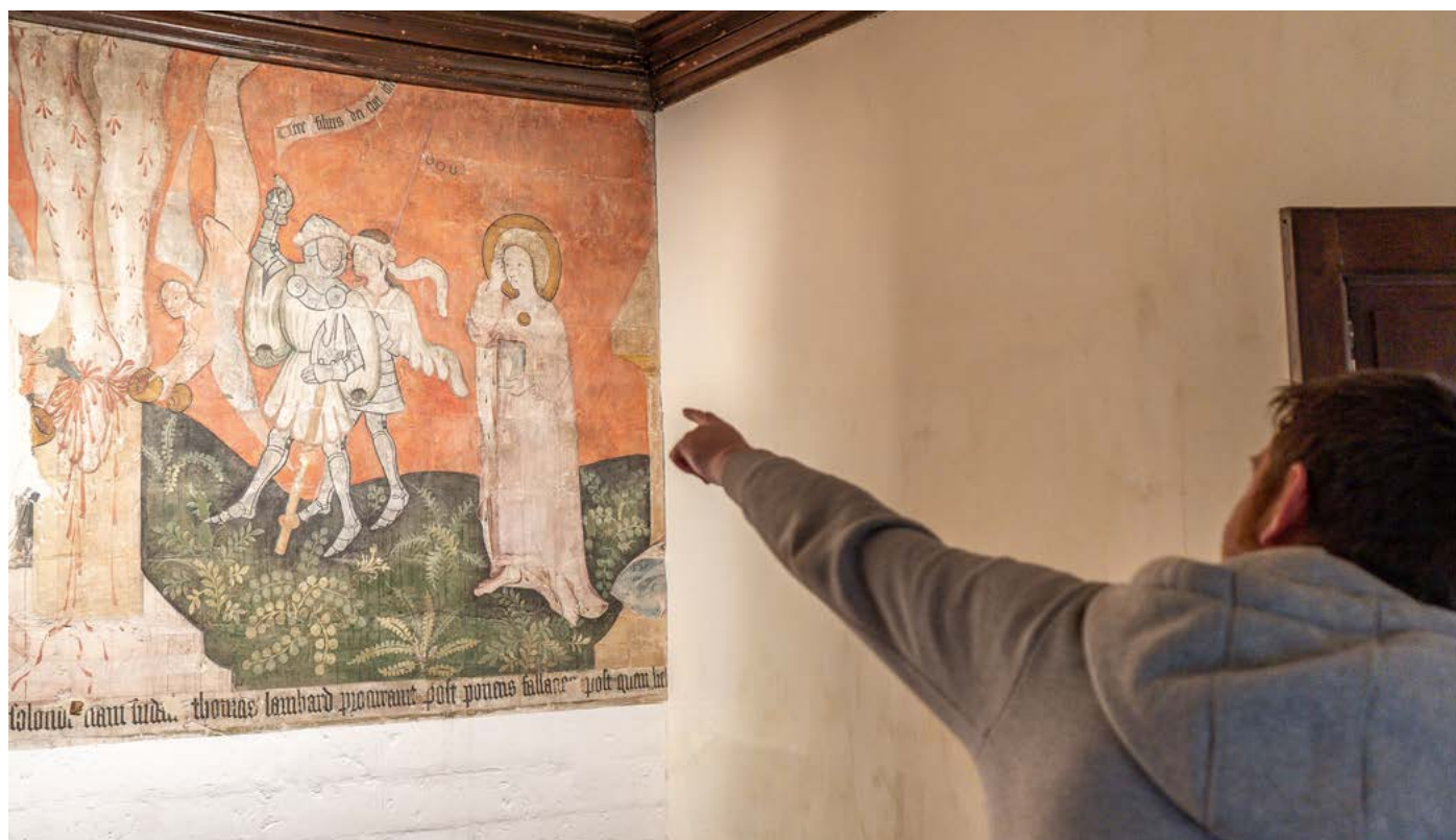
Visitors are finally able to visit the newly-renovated Charterhouse in April 2023.

The award of just over £2m from National Lottery Heritage Fund to Warwickshire Wildlife Trust has allowed the start of a new citywide River Sherbourne project and at Charterhouse this will allow us to open up routes for public engagement and education without impacting on the exceptional level of wildlife that is present in this urban location.