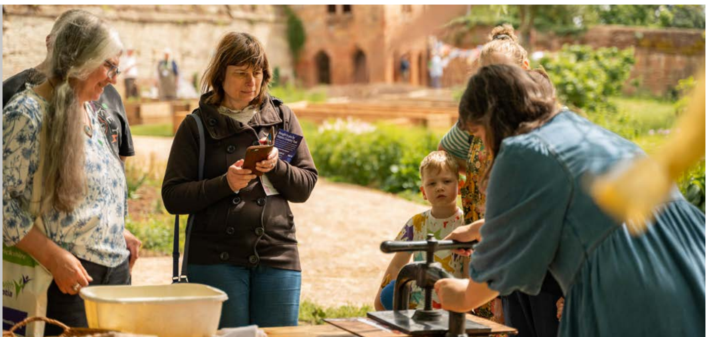
Activities at a Charterhouse Reveals event in the spring of 2022.

Working with CineCov we have continued to host a popular series of film nights in the Anglican Chapel of which the showing of horror movies on Halloween has proved unsurprisingly popular in this gothic setting. Other community events included the Dead Good Death Café where people come together to talk about death, which is often taboo in our society.