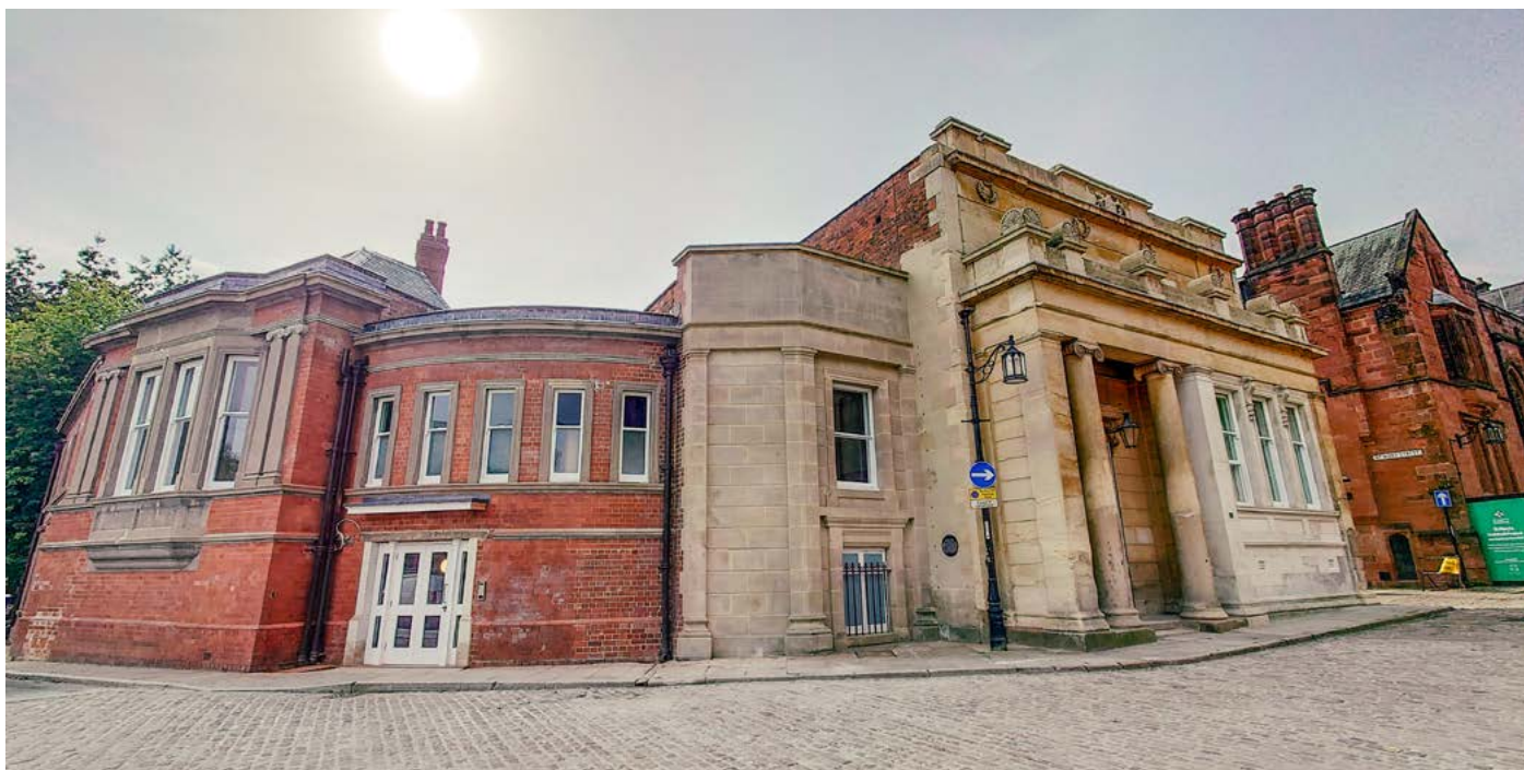
Reopened to the public in November 2021, the newly restored Drapers' Hall is now home to Coventry Music Service.