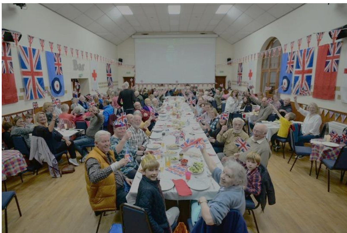
Queen's Platinum Jubilee Celebration (Organised by MiCE)