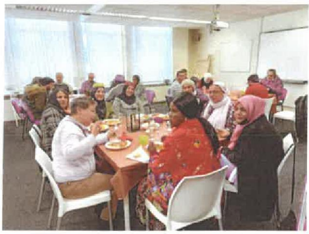
Busy ESOL class