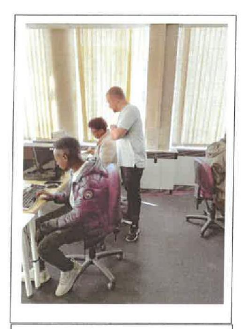
ICT Suite - ICT and Employment