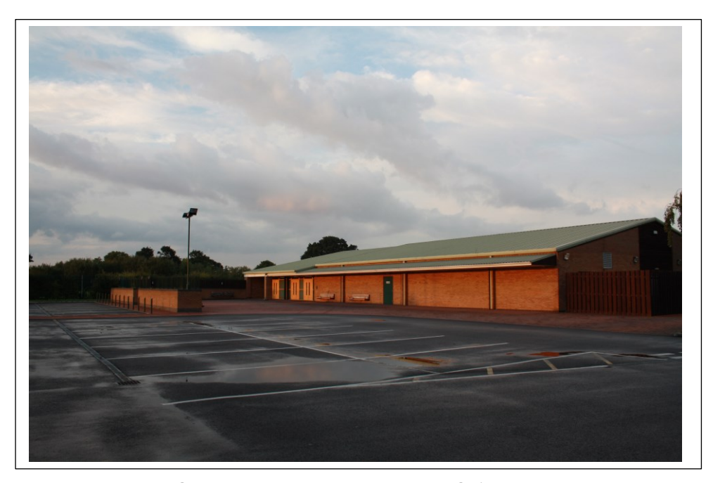
The Gospel Hall at Westward Ho, Grimsby

One of the Trust's principal activities that furthers its objects is providing a facility for the coordination of "outreach" work into the wider community.